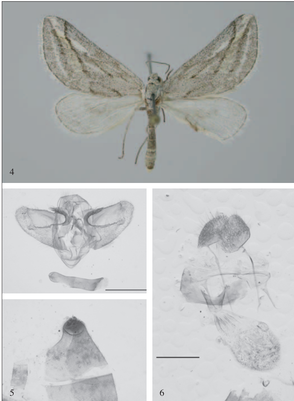
Figs. 4–6. Lithostege notata Bang-Haas, 1906 (= bifissana Rebel, 1911). 4. Habitus of specimen from Jordan, 20 km NE Dead Sea. 5. Male genitalia and sternum A8 (Israel, southern Dead Sea region). 6. Female genitalia (Israel, southern Dead Sea region). Scale bars 1 mm.