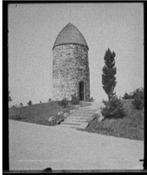
The Powder House at Nathan Tufts Park, 1704, picture from early 1900s

During the early 1890s, another West Somerville hill—Quarry Hill-- figured prominently in a Tufts family gift of land that resulted in a mid-sized park called Nathan Tufts Park . This park contains one of Somerville's most storied and iconic landmarks: the Old Powder House . Built in 1704 as a windmill and later, in its most famous incarnation, it served as a gun powder storage facility whose explosive material was confiscated by British Red Coats in Sept 1, 1774 before it could fall into the hands of local colonists. The seizure is considered a pivotal event leading to the American Revolution.