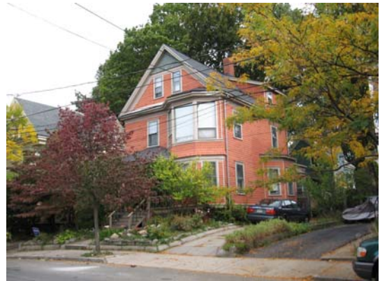
44 Kidder Avenue