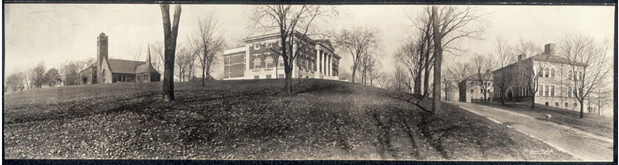
Tufts University circa 1910