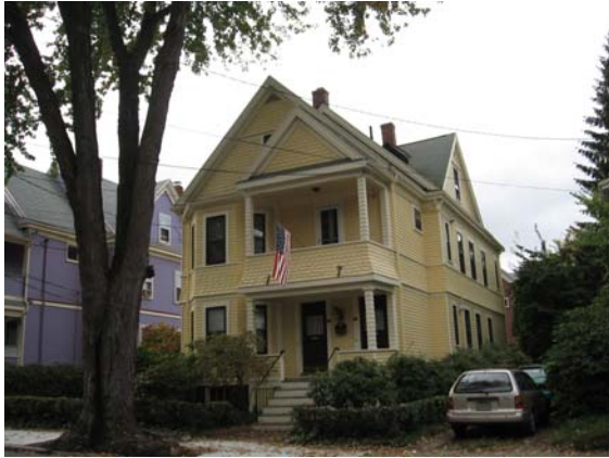
31-33 Kidder Avenue

31-33 Kidder Avenue was built in 1894 by and for the local contracting firm of Robbins and Stevens. Representing a well-preserved example of the Queen Anne style, this impressive, wood shingle-clad residence retains its original two-tier porch that is completely covered with wooden shingles.