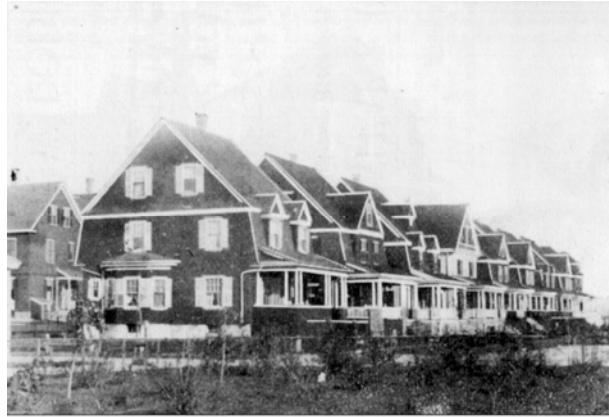
These Colonial Revival houses were built on Highland Road, Highland Park, in the Somerville

46 and 48 Rogers Avenue, corner of Kidder Avenue, were built in 1901-1902 as fine, nearly identical examples of a compact Shingle Style house. The first owner of number 46 was Samuel W. Staples who moved from School Street to this house. 48 Rogers Avenue's first owner was Lawrence G. Ripley, piano tuner.