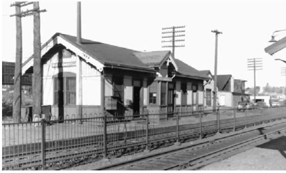
North Somerville Train Station

As early as 1836, the Boston and Lowell Railroad crossed Broadway at the eastern end of the square, making this area a natural crossroads.. In the not too distant future Ball Square will once again have direct access to a train when the Green Line extension from Lechmere Station in East Cambridge is thrust through Somerville to the Tufts campus. Already called the Breakfast Capital of Greater Boston. Ball Square's plethora of ethnic and all-American restaurants will become accessible to a wider spectrum of T-riding diners.