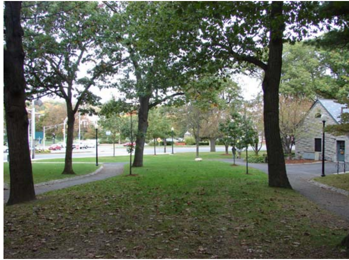
Nathan Tufts Park with the Field House just visible to the right rear of the photograph.