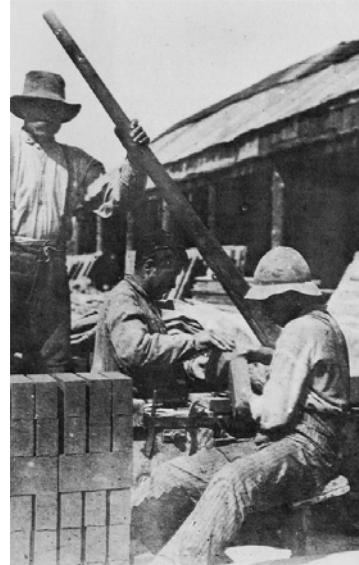
Workers using a brick-making machine at the Brickyards on lower College Avenue.

Until as late as the 1880s, the Nathan Tufts family owned most of the land located between College Avenue and Cedar Street. Tufts had been living in the area well before the American Revolution. Fast forwarding to the 1870s, the Tufts family domain between Powder House and Ball Squares embraced a substantial farm house that was located on the site of the two family houses at 771 and 773 Broadway as well as extensive farmlands, a pickle factory and, above all, brick yards. Indeed, between the 1830s and the 1870s, the sheds, kilns and clay beds of the Tufts Brick Manufactory Company dominated the landscape of the large area bounded by Willow, Morrison, Cedar and Broadway. The introduction of the Boston & Lowell Railroad in 1836, at the eastern edge of the tour area, had everything to do with the initial prosperity of the Tuft's brick manufacturing enterprise, while the national financial crisis of 1873 hastened its demise.