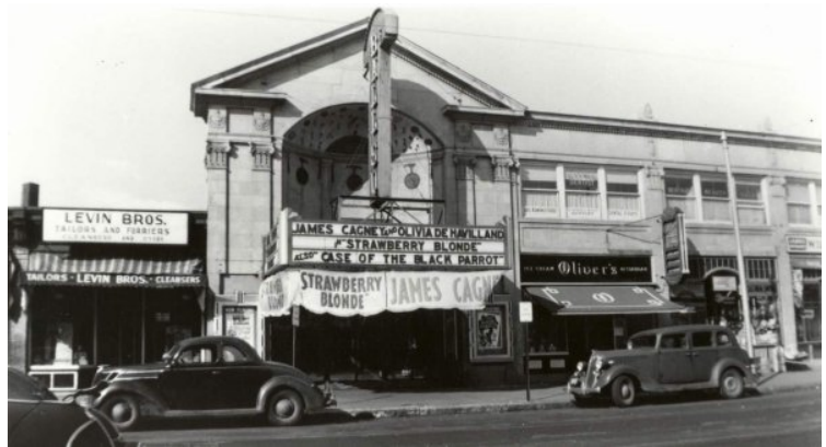
Locatelli's Theatre in Davis Square circa 1941