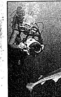
UP CLOSE: Stalk 'The Man Who Loves Shark'