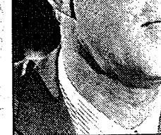
JOHN F. KENNEDY: at center of 'Garrison

pre-game, No. 11. 60 Minutes ranked No. 4 and Murder, She Wrote , No. 10. CBS' Locked Up: A Mother's Rage , won the Sunday movie race, at No. 14. NBC's Carolina Skeletons ranked No. 21, ABC's Crossing Delancey , No. 28.