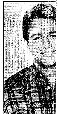
DANZA: 'Gettin' upbeat about inn

The challenge reflect the hardst the triumphs, in If Danza and cor sist oversimplific make for good, t