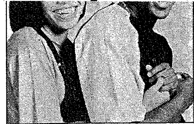
Fox 'MARTIN': Tisha Campbell, Martin Lawrence ranked 37th in first outing.

NBC was in third place, with Blossom in the top 10 the third week in a row.