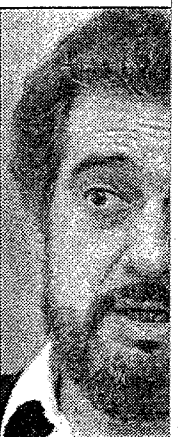
DOMINGO: Play 'Girl of the Gold'