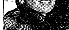
SUSAN LUCCI: Shut out at the Daytime Emmys again

In the Sunday movie lineup, it was CBS' Sins of the Mother (No. 5); NBC's The Empire Strikes Back (No. 10); and ABC's Sudden Impact , tied with A Different World and Step by Step at No. 32.