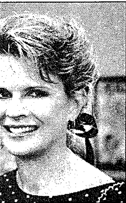
CBS CE BERGEN: 'Murphy stole the ratings show.

the evening news race, World News Tonight re- to its top spot, followed and NBC.