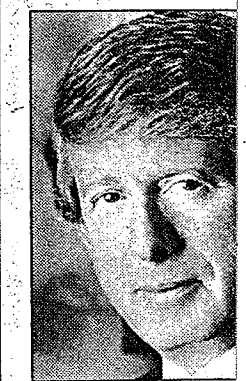
TED KOPPEL: No overview for ABC's

Peter Jennings: A... review of the ne... film, Bob Robert ... weekly New York C