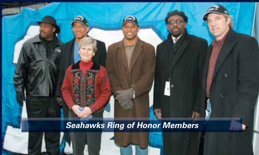
Seahawks Ring of Honor Members