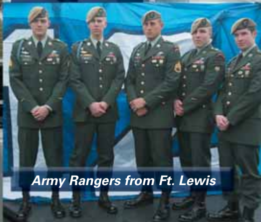
Army Rangers from Ft. Lewis