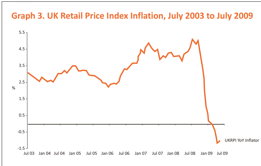
Graph 3. UK Retail Price Index Inflation, July 2003 to July 2009