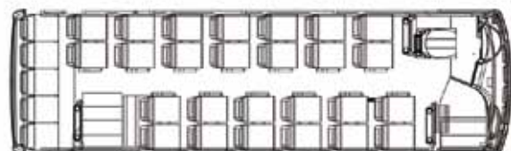
31 SEATED + 1 HOSTESS SEAT

Alternative configurations available on demand.