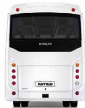
LARGE, EASILY ACCESSIBLE LUGGAGE SPACE

The Navigo T , a market leader in its segment, is a compact and comfortable midi coach that's built to meet all your needs. It has capacity for up to 35 passengers and includes a 3.5 m 3 luggage compartment. Automatic transmission and cruise control increase driving comfort. Passengers can relax in the spacious, air conditioned interior and enjoy on-board entertainment throughout their journey.