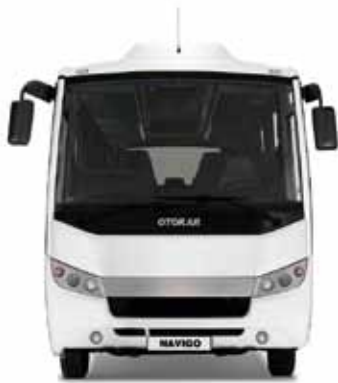
AUTOMATIC TRANSMISSION FOR A SMOOTH DRIVE