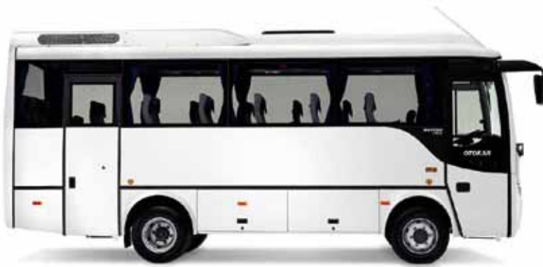
COMPACT SIZE FOR EASY HANDLING ON ALL KINDS OF ROADS