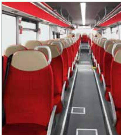
RECLINING SEATS WITH LEATHER HEADRESTS