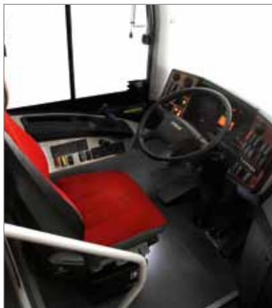
ERGONOMIC DRIVER AREA