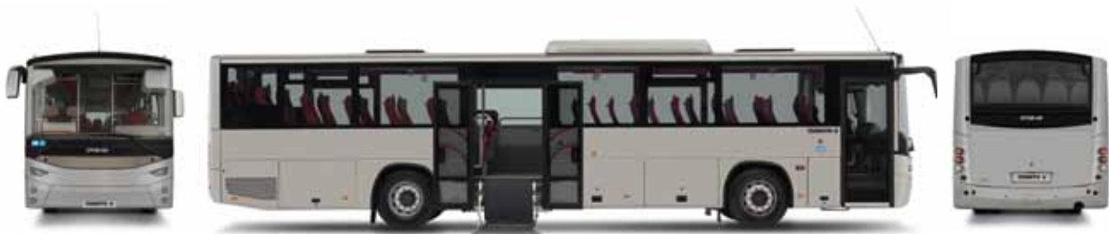
DOUBLE WING TYPE MIDDLE DOOR AND WHEELCHAIR LIFT