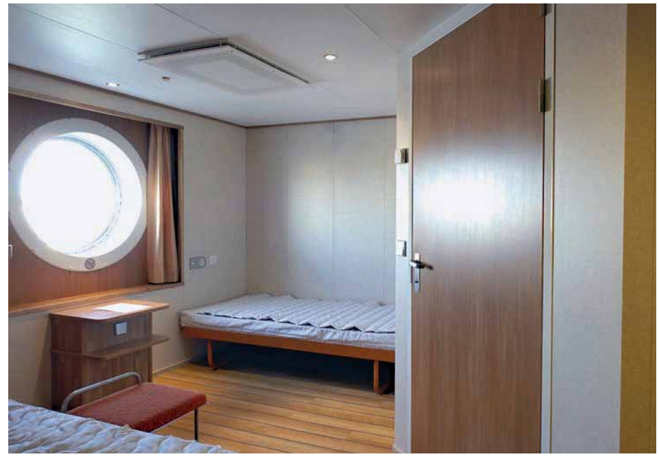
Although primarily a day ship, Star has a number of cabins so that short overnight cruises can be offered

After delivering Star , Aker Yards' cruise and ferry order book contains a further 21 vessels, 11 of which are cruise ships and 10 are ferries. The order book includes four of the world's largest cruise vessels (Genesis class), the biggest cruise ferry ( Color Magic for Color Line) and two of the world's largest ropax ferries (for Stena). FT