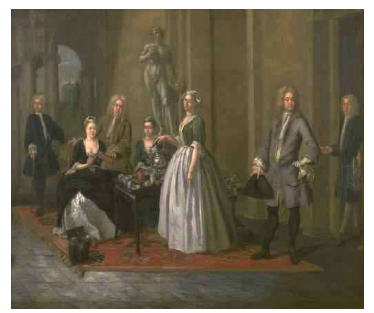
Joseph van Aken, An English Family at Tea, c.1720, The Tate, London (Figure 2)

In the 1730s and 1740s, on account of his talent in rendering materials such as satin, velvet and gold lace, van Aken abandoned independent work, taking up employment as a drapery painter for other artists. He worked for many leading portrait painters of the day, including Joseph Highmore (1692-1780), Thomas Hudson (?1701-1779), George Knapton (1698-1778), Arthur Pond (1701-1758), Allan Ramsay (1713-1784) and Joseph Wright of Derby (1734-1797). Usually, these artists painted only the face of the sitter, leaving van Aken to fill in the rest of the composition. Some of these artists often relied heavily upon his judgement, an example being Winstanley, who painted his faces on a piece of cloth which van Aken would then paste onto a larger canvas, arranging the composition himself. However, others, such as Ramsay, sent him drawings and instructions suggesting postures and draperies. In 1737, the English writer and engraver, George Vertue (1684-1756), remarked that van Aken had lately excelled in painting 'particularly the postures for painters of portraits who send their