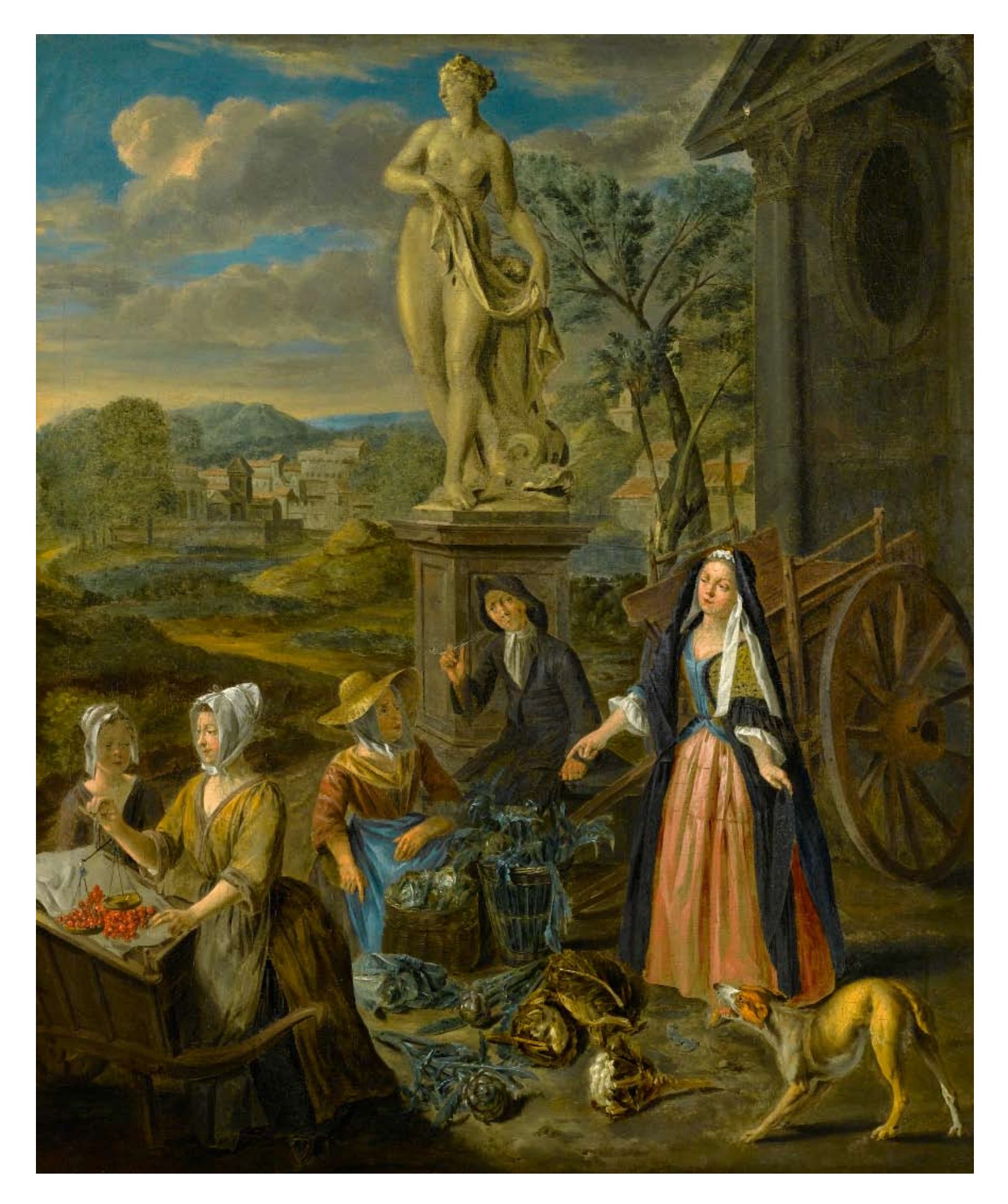
Joseph van Aken, A Vegetable and Fruit Market by a Statue of Venus, with a Town by a River Beyond