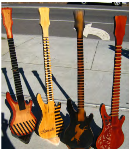
Year 11 Furnishing - free standing CD/DVD storage racks designed resembling a guitar

This semester students are transforming their computer aided designs into a real working trebuchet. For almost all of our Engineering students, working in a workshop setting with timber and industrial machinery is a new experience. As well as facing the challenge of a new learning environment, students are actively problem solving between their theoretical designs and how this actually transfers in the practical sense, through the construction process. They have taken to the changes well and are reading working drawings, problem solving, applying past knowledge to new situations and working interdependently so they can test their trebuchet in the coming weeks.