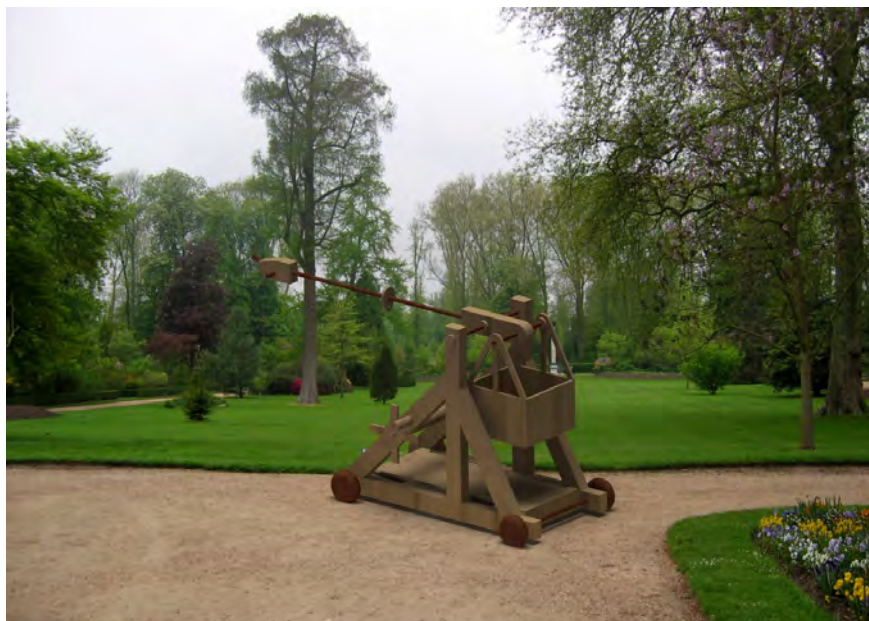
Year 8 Aspire – A three dimensional representation of S.Sareen's trebuchet design

The BEAST computer labs were again utilised for a range of BEE and Graphics assignments before the holidays. It was so pleasing to see the commitment and passion students exhibited in working on their folios before and after school. Students were designing houses in Year 9, surf clubs in Year 10 and 5 Star hotels in Year 12. The Year 10 cohort for BEE students elected to design a surf club for their major folio. On face value this seemed like a fantastic idea from students and at their level of understanding. As the planning and investigation of the folio were underway, students and staff discovered the complexities of the project in relation to safety requirements, accessibility for disabled persons, storage for surf