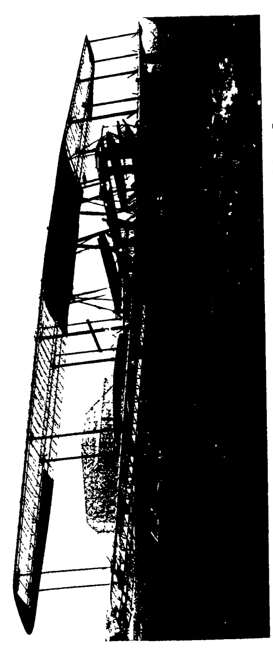
Skeleton of a large Gotha bomber, in the hands of N_{\rm O} 4 Squadron, A F C \, at Cologne, German', December, 1918