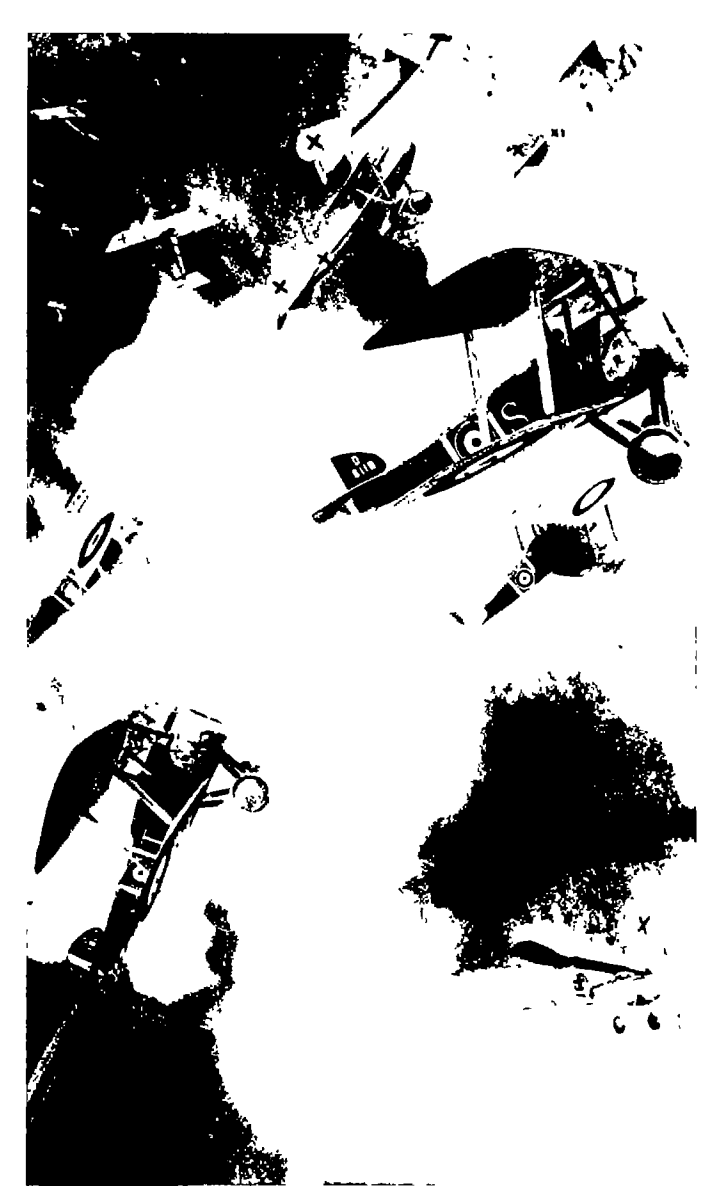
COMPOSITI PHOTOGRAPH AND DRAWING, SHOWING AN ATTACK BY A BRITISH SCOUT-FORMATION THROLGH A CLOUD UPON A GIRMAN FORMALION

In the distance enemy machines are turning to counter-attack