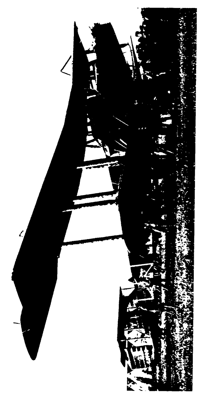
A BIG HANDLEY-PAGE BOMBER, OF THE TYPE USED BY THE ROYAL AIR FORCE ON BOMBING RAIDS INTO GFRMANY

Just H an Waxann Official Photo No Fifth