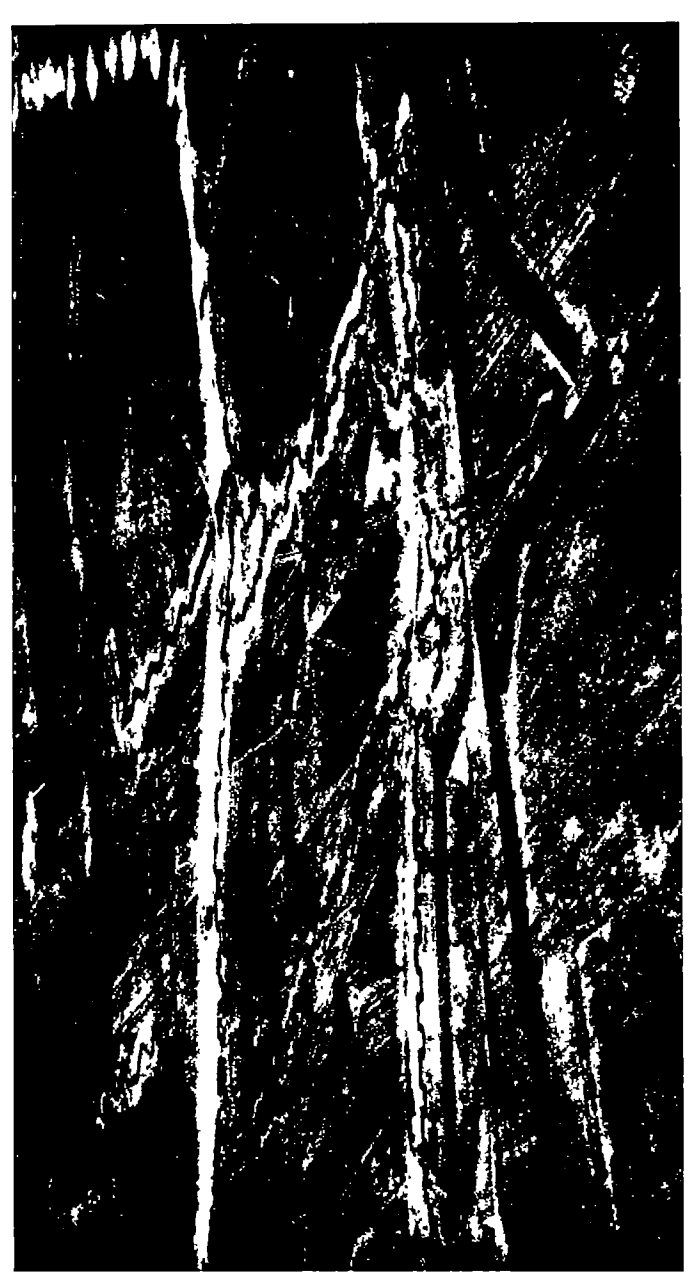
AEROPIANF PHOLOGRAPH OF A POINT IN THE HINDENLUKG LINE, SHOWING SYSTEMS OF TRENCHES AND WIRF