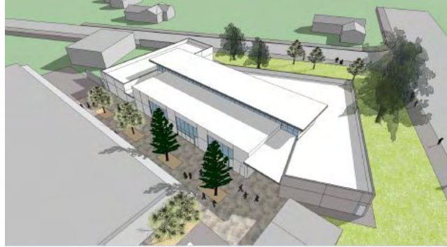
Rendering of the New Building

The plans for the new building are currently being reviewed by the Division of the State Architect (DSA), which is a state agency that governs school construction. Once the project is approved by DSA, the District will bid the project and the Board will have to approve the award. Construction is tentatively planned for this summer.