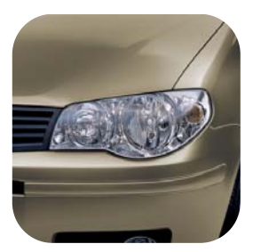
716 Avant-garde Beige