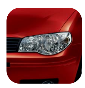
199 Rumba Red