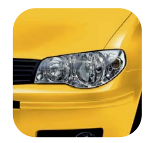
504 Exotica Yellow