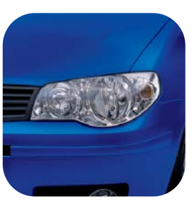
451 Swing Blue