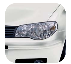
249 Ambient White