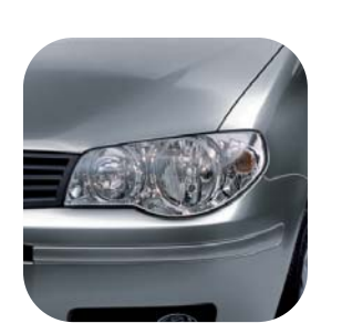
284 Techno Grey