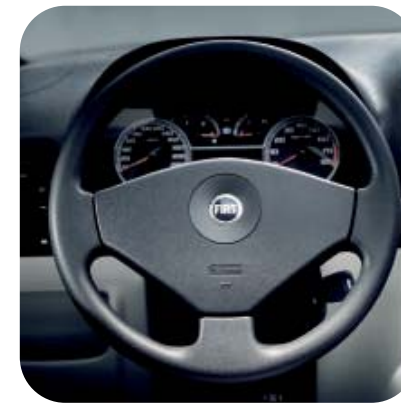
Height adjustable steering wheel with power steering.