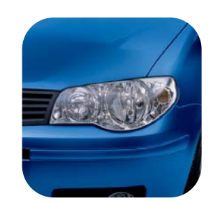
597 Bebop Blue