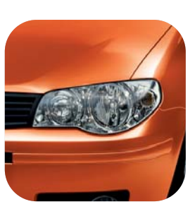
505 Samba Orange