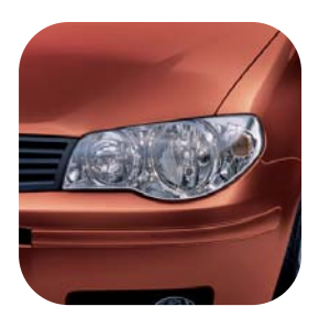
149 Sevillana Red