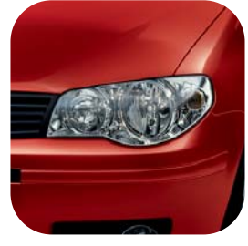
132 Salsa Red