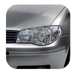
647 Electro Grey