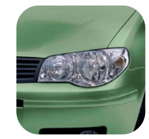
795 Polka Green