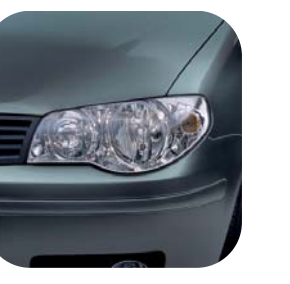
697 Progressive Grey