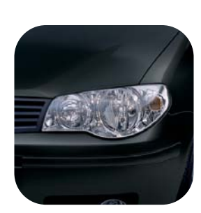
632 Rockabilly Black