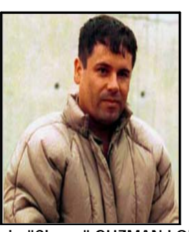
Joaquin "Chapo" GUZMAN LOERA Identified by the President as a significant foreign narcotics trafficker on June 1, 2001