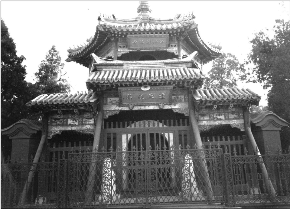
Fig. 3. Mosque at Niujie, built between 916 and 1125 A.D., and renovated in the 1980s. The top front sign reads “Niujie Mosque” and the one below reads “the good path to heaven.”

research indicate that from as early as the Tang dynasty (618–907), the location of today’s Niujie had been on the periphery of the city of Beijing (Yu, 1981; Zhen, 1982; Tada, 1986; Weng, 1992). Like most larger Hui communities in Beijing, Niujie has its own mosque, which was built between 916 and 1125 (Fig. 3). The gravestones of two imams in the mosque suggest that a sizable number of the Hui people lived there as early as the Yuan dynasty (Liu, 1990). The origins of the settlement probably were related to the Muslims in Central and Western Asia who joined Genghis Khan’s army and moved eastward as Kublai Khan established the Yuan dynasty. As the capital of the Yuan dynasty, Beijing became the home of many Muslims. At the time, Niujie was called Willow River Village, which was located outside but close to the main city wall of Beijing (Fig. 2). Such peripheral location reflected separation between the Hui people living there and the Mongolian residents living within the city wall.