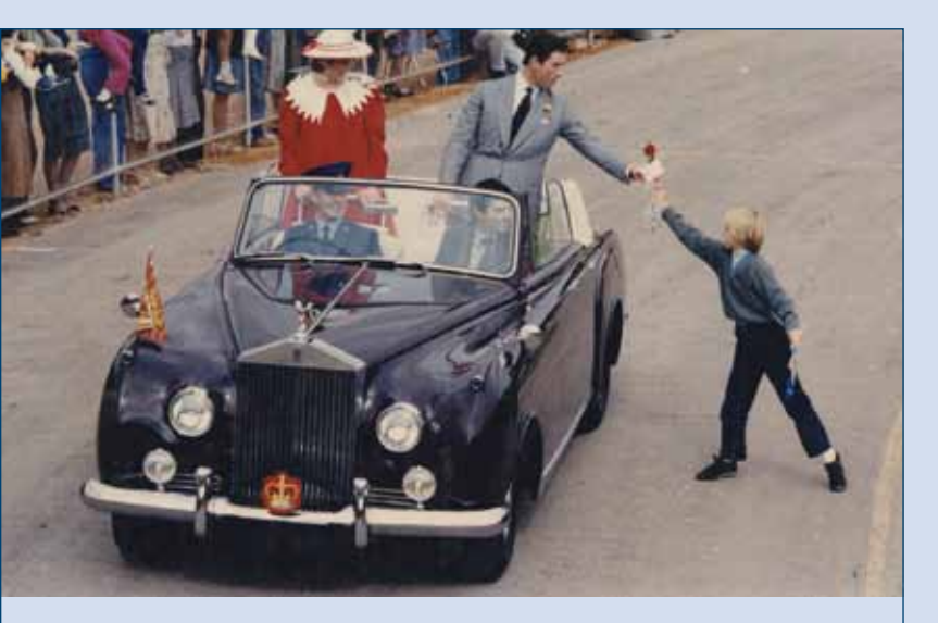
Princess Dianna and Prince Charles, Melbourne, 1983.

This decade saw the collapse of the ideas which Australia had embraced nearly a century before and which had shaped the condition of the people. The 1980s was a time of both exhilaration and pessimism, but the central message shining through its convulsions was the obsolescence of the old order and the promotion of new political ideas as the basis for a new Australia.<sup>2</sup>