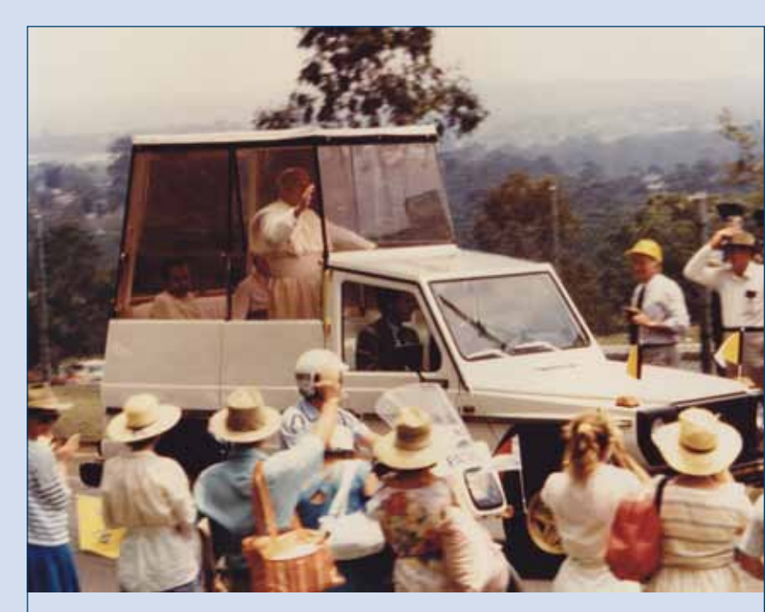
Pope John Paul II, Brisbane, 1986.

Cars were provided for the first seven categories at all times, including weekends and holidays, except in extreme circumstances when a hire car was provided; parliamentarians and others were provided with a Commonwealth car whenever possible, otherwise with a hire car. All entitlees were charged $50.50 per hour with a minimum charge of 30 minutes during normal business hours and two hours outside business hours. The 'executive service' provided for budget and non-budget Commonwealth Government bodies, statutory authorities and embassies. Cars were provided during normal hours and after hours when cost effective, otherwise hire cars were used. The rate varied between regions but was comparable to that charged by hire car companies. The 'standard service' was provided to budget-funded Commonwealth departments and statutory authorities during working hours at rates determined by the regions in accordance with local taxi rates. Provision of appropriate classes of cars for visiting heads of state and other dignitaries was decided by the Special Services Section and charged at entitlee rates.<sup>4</sup>