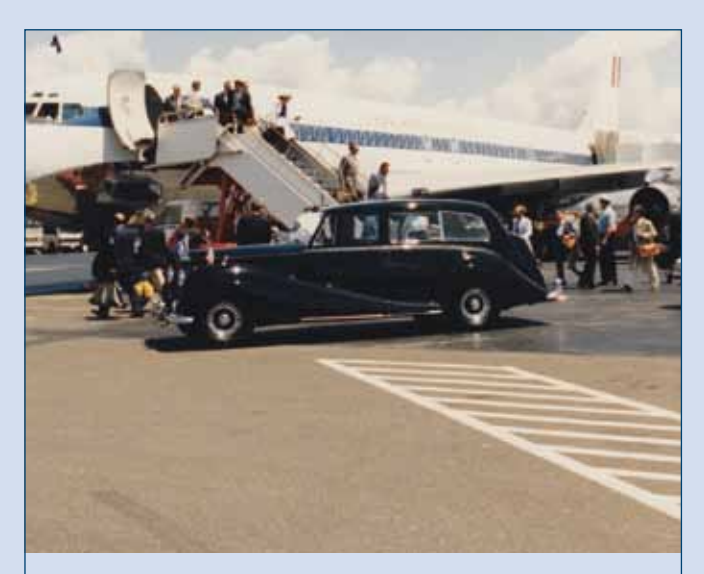
Motorcade at Brisbane airport collecting distinguished visitors to the Bicentenary Expo, 1988.

Three days after the 1987 election, Prime Minister Hawke announced major public administration reforms that included abolition of the Public Service Board, rationalisation of employment categories within the public service, creation of portfolio ministers and a thorough re-organisation of government departments. With the idea of having the public service do more with less, 27 departments were restructured into 18. The objective of the reorganisation was to achieve "administrative efficiencies and savings, better policy coordination and improved budget processes". Traditional service departments were to be transformed into businesses with commercial charters where possible. The second-tier wage agreement between the Public Sector Union and the Australian Government came into effect on 24 December 1987 and introduced broad-banding by doing away with many employment levels within the public service. This was designed to encourage multi-skilling of people and develop a participative team approach to issues.