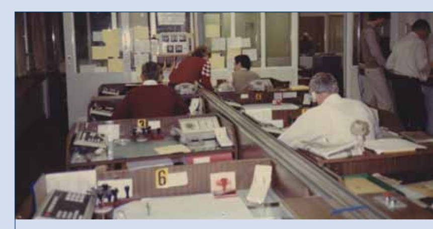
Melbourne reservation and allocation centre.

The number of parliamentarians largely determined the size of the Commonwealth car fleet and number of drivers in Canberra. In 1988, there were 138 full-time drivers and 30 depot staff in the Transport and Stores Group in Canberra; 32 drivers were assigned as first-call drivers to ministers and office holders. Fleet resources during parliamentary sittings were complemented by 22 hire cars in Canberra and Queanbeyan and some of the 168 Aerial taxis.<sup>37</sup> Rates were set at a level to recover the costs of operating the car fleet, with cars being charged for the total time they were engaged by the Parliamentary Transport Officers and not for each journey.<sup>38</sup> Drivers were not permitted leave when parliament was sitting.