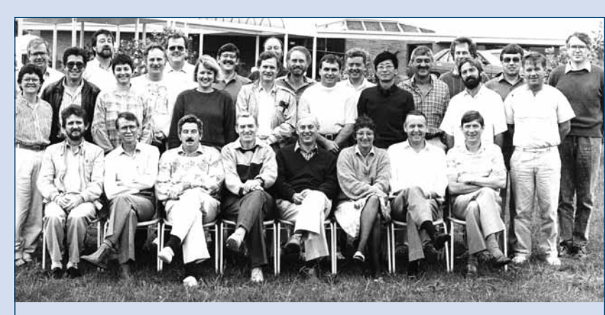
Transport and Storage Division managers meeting, 1989.

Meanwhile, management still wrestled with the long-standing dilemma of the parliamentary shuttle in Canberra. There was the requirement to provide quality service for highly seasonal and fluctuating ministerial and parliamentary business, and the need to supply a transport service for public servants in Canberra and interstate in order to sustain the service during non-parliamentary periods.