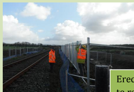
Erection of Fencing to railway