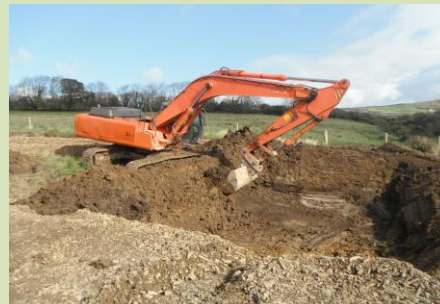
Site Clearance & Earthworks