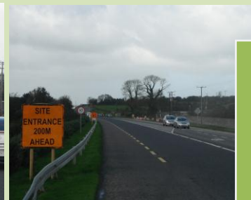
Traffic Management for the construction of new Roundabouts on the Listowel and Castleisland Roads

Speed Limit Order: The existing 60km/h has been extended along a section of N21 National Primary Roads in the townland of Curraghlae, Castleisland Road. This is in order to facilitate the construction of the proposed roundabouts with the by-pass.