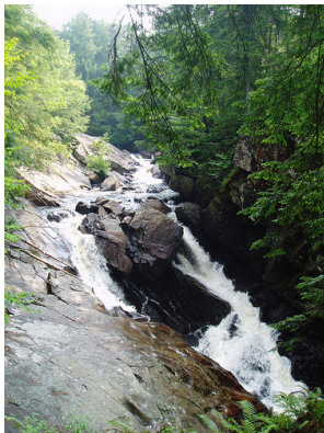
Auger Falls, Wells

On this walk you'll find a series of easy dropping falls flowing along the trail which is surrounded by a dark Cedar & Hemlock forest. The falls are 15 feet wide, and travel for almost a 1/2 mile. Location: 2.0 miles S of downtown Inlet: Head south on 28 from Inlet for .8 miles, and make a R (at the golf course) heading south onto Limekiln Road. Drive for another 1.8 miles to the Limekiln Lake DEC Campground entrance. The trail starts at campsite #87. Travel across the large open field, to find a register box at the old fish barrier dam, where the self guided nature trail starts. Travel to the R for 1.0 mile around the old beaver vly, until the trail bears R after a series of bridges. Follow the outlet for Limekiln Lake for about 0.75 mile as the trail crosses the brook several times and you'll come to the start of the falls, which continues for another 1/2 mile. There is a day use fee to enter the campground.