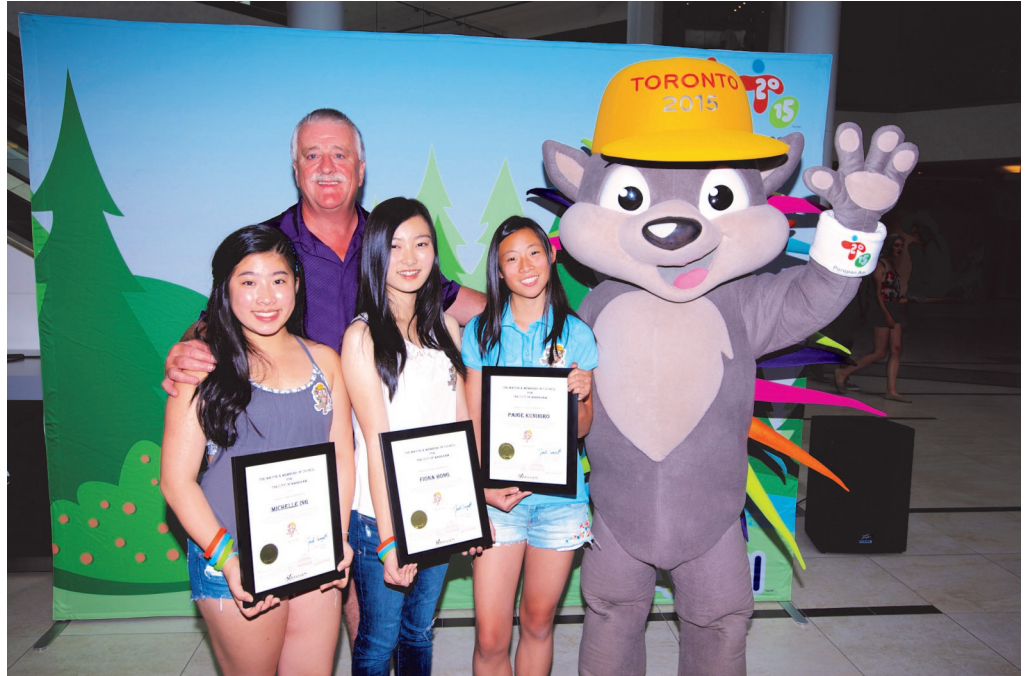
A MADE-IN-MARKHAM MASCOT: I pose with some of the Buttonville Public School students who created Pachi, the official Pan Am mascot. The porcupine has 41 quills — one for each country participating in the Pan Am Games. The City of Markham will be host to some exciting competitions during the 2015 Pan Am Games.

Plowing: Primary and secondary roads are cleared as soon as snow begins to accumulate. Residential streets are plowed only after there is more than 7.5 cm of snow. Please keep in mind that it takes a while to clear all