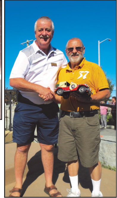
OUT AND ABOUT: From bottom left: celebrating Markham's 81% waste diversion rate at an August press conference; participating in the Canada Day parade; honouring the graduates of a seniors' computer course; presenting one of the winners of the Markham Auto Classic.