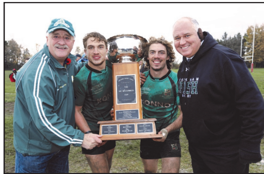
WE'RE NUMBER ONE: On October 26, my own club, the Markham Irish Canadian Rugby Club won the McCormick Cup, Ontario Rugby's championship. I am a huge rugby fan, having played myself, and congratulate all team members on their victory.

All members of your household must be over 65 (or less than 12) or you must provide a doctor's note indi-