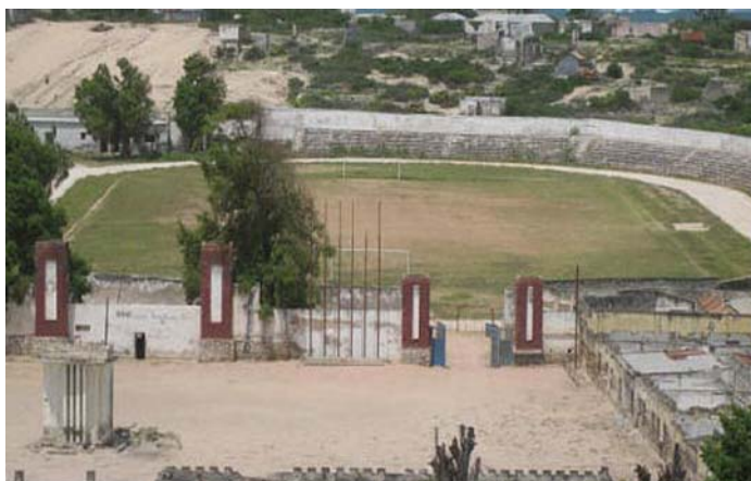
The Benadir Stadium in Mogadishu before its renewal

Further information on Win in Africa with Africa: http://www.fifa.com/mm/goalproject/WinAF_E.pdf