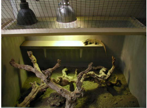
Vegetable bins with mesh lids have proven to work well for housing juvenile iguanas at CRES, San Diego Zoo.

age, juveniles are transferred to adult enclosures. St. Catherine's Wildlife Survival Center has had similar success raising hatchlings and juveniles in covered cattle troughs.