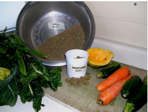
Some of the standard CRES dietary items.