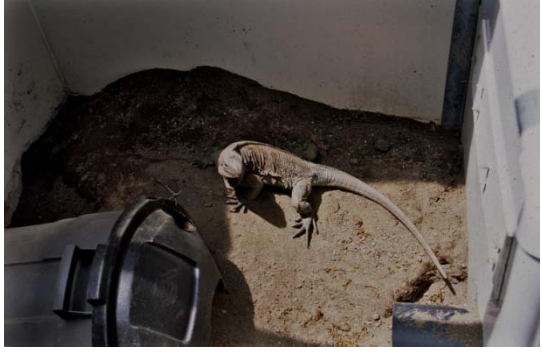
Captive iguanas will usually guard the nest area after eggs are laid. Both animals in these photos chose to lay in the trash bins, which were located within large nesting areas in the corners of their indoor cages. The C. collei (top left) laid infertile eggs while the C. pinguis (top right) shown here produced the first clutch of offspring in a zoological facility from this nest. The eggs have been exposed for the photo (bottom).

Perlite or vermiculite should be used as incubation medium. The mass of substrate should equal 3-5 times the mass of the total clutch of eggs, and should be placed in a large plastic box with a loose-fitting lid. It is important that ample airspace is provided above the eggs within the box. An optimal incubation box should have as much air space as substrate. Substrate is mixed with water at a ratio of one to one, by weight, and incubated at 84.2 - 87.8 \degree F (29.0 - 31\degree C) . The 1:1 substrate to water ratio is used in most facilities and is valuable in situations where eggs are slightly desiccated (usually because eggs were not found in a timely manner or nesting substrate was too dry). Using the 1:1 ratio, egg boxes rarely need to have water added to them, depending on the type of incubator and ventilation of boxes. Some facilities use a Perlite/vermiculite to water ratio of 2:1. This ratio is most often used in facilities that weigh egg boxes regularly and add lost water upon each weighing. The 2:1 ratio is also useful in instances when the incubator in use does not have a fan or egg boxes do not ventilate well, and so the drier mixture helps keep excess moisture from building up on the inside of egg box lids and dripping on the eggs.