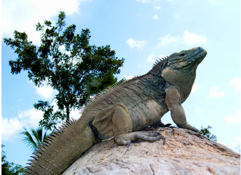
The Grand Cayman Blue iguana is one species for which a Population Management Plan (PMP) has been initiated.

recommendations for the Grand Cayman facility also provide genetically diverse progeny for release into protected areas to prevent wild extinction of this species.