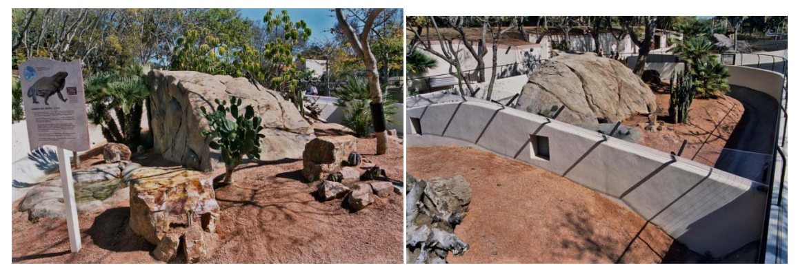
Display enclosures for C. collei and C. pinguis at the San Diego Zoo