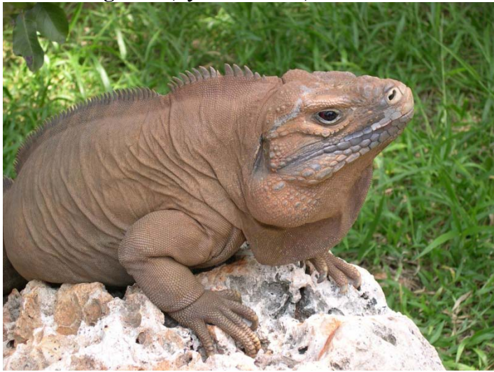
Male Jamaican iguana (Cyclura collei)

Geographic range: Hellshire Hills region of southeastern Jamaica