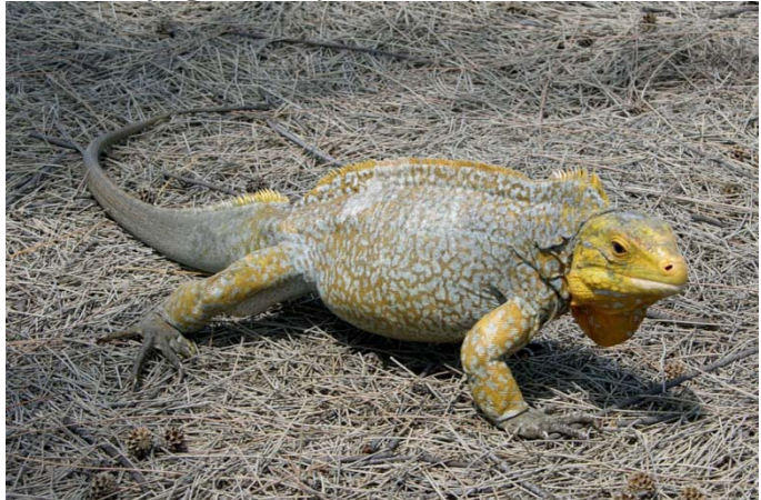
Adult White Cay iguana ( Cyclura rileyi cristata )

Geographic range: White (= Sandy) Cay, Southern Exumas, Bahamas Adult size: up to 28.0 cm SVL Dietary notes: primarily herbivorous Size/age at sexual maturity: unknown Time of mating: unknown, but probably May-June Time of oviposition: unknown, but probably June-July Nesting parameters: unknown Number of eggs: unknown Temperature/duration of incubation: unknown Egg size: unknown Hatchling size: unknown Growth rates: unknown References: Hayes, 2000.