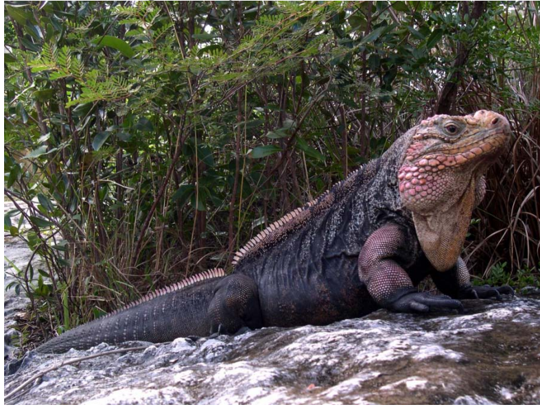
Male Andros Island iguana (Cyclura cychlura cychlura)

Geographic range: Andros Islands, Bahamas Adult size: males up to 47.6 cm SVL; females up to 46.5 cm SVL Dietary notes: primarily herbivorous, although crabs are also consumed. Size/age at sexual maturity: mean size of reproductive females is 36.2 SVL and 2080 g. Time of mating: not observed, but probably April Time of oviposition: early May to mid-June Nesting parameters: unknown, but where soil is limited, iguanas use termite mounds for nesting. Number of eggs: 4-19 (avg. 8.8) Temperature/duration of incubation: 32.8 °C (91.0 ° F) in termitaria. Egg size: average 70.7 mm x 40.3 mm; 59.8 g Hatchling size: average 9.6 cm SVL; 37 g Growth rates: unknown References: Buckner and Blair, 2000b; Knapp et. al , 2006; Knapp, 2002; Knapp, 2001; Knapp et al. , 1999; Schwartz and Henderson, 1991.