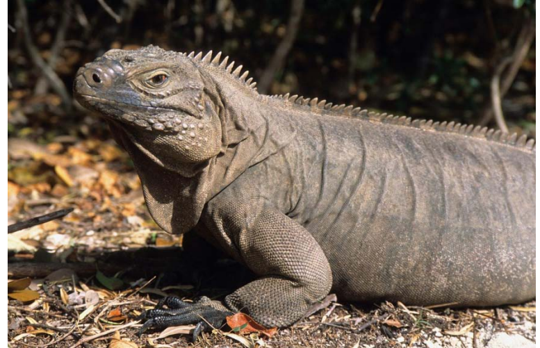
Adult female Sister Isles rock iguana (Cyclura nubila caymanensis)

Sister Isles rock iguana (Cyclura nubila caymanensis)