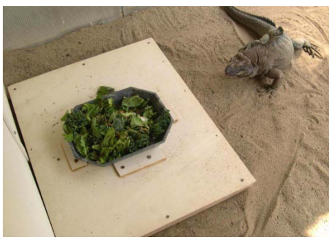
Dishes should always be used to keep substrates out of food. Because sand can possibly cause gut impactions, the dish of this C. collei is elevated off the substrate with a plastic platform.