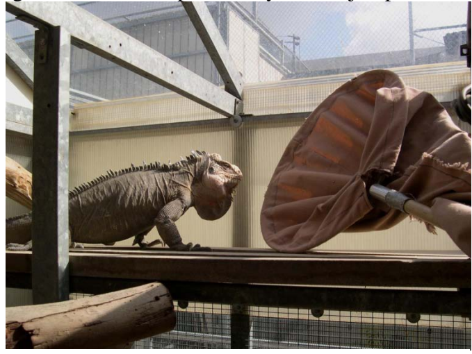
Nets are the easiest, least stressful way to capture large iguanas, such as this I. delicatissima .

Perhaps the easiest, least-stressful way to capture an animal from within an enclosure is with a net. Large fishing nets, with the net replaced by a sturdy cloth bag, work well for this purpose. Netting rips easily and iguanas have the ability to break through the net and escape or they may become tangled in the netting. "Hand-grabbing" or manually capturing iguanas works well with younger animals, or larger, non-aggressive adults. Keep in mind that when cornered, some iguanas may become very agitated and some species may rush or jump toward the keeper with open mouths.