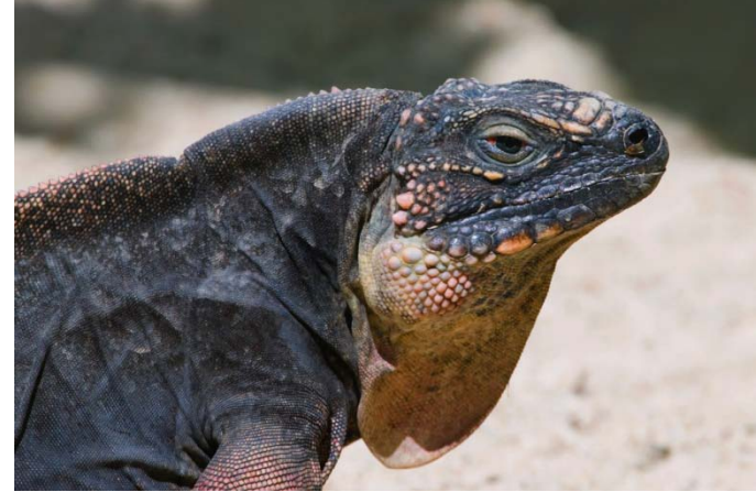
Allen's Cay iguana ( Cyclura cychlura inornata )

Geographic range: northern Exuma Islands, Bahamas