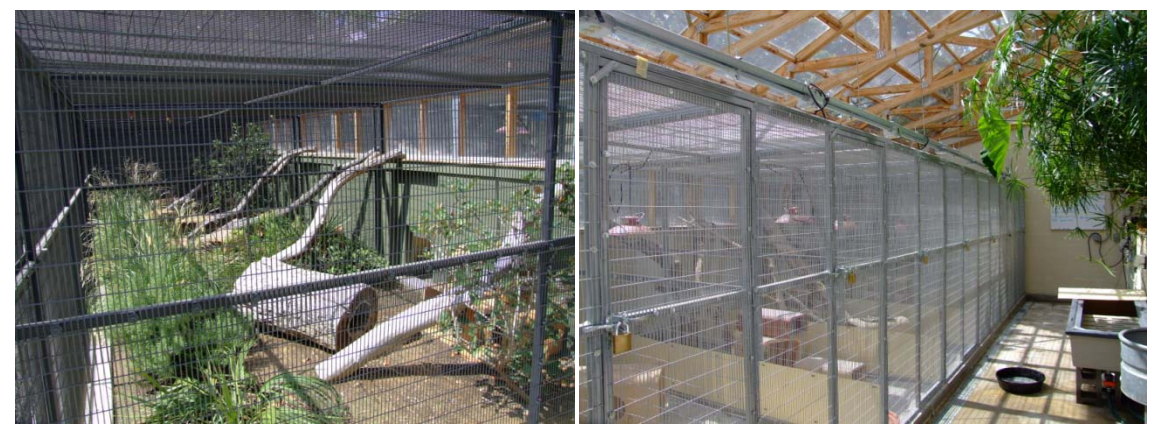
The Reptile Greenhouse is part of the Fort Worth Zoo's Animal Outreach & Conservation Center (ARCC) and is designed to support breeding groups of endangered rock iguanas (Cyclura) and Asian chelonian species.

Five outdoor iguana yards with adjacent inside holding are featured at the Fort Worth ARCC facility. Species targeted for captive breeding include the Jamaican and Anegada iguanas.