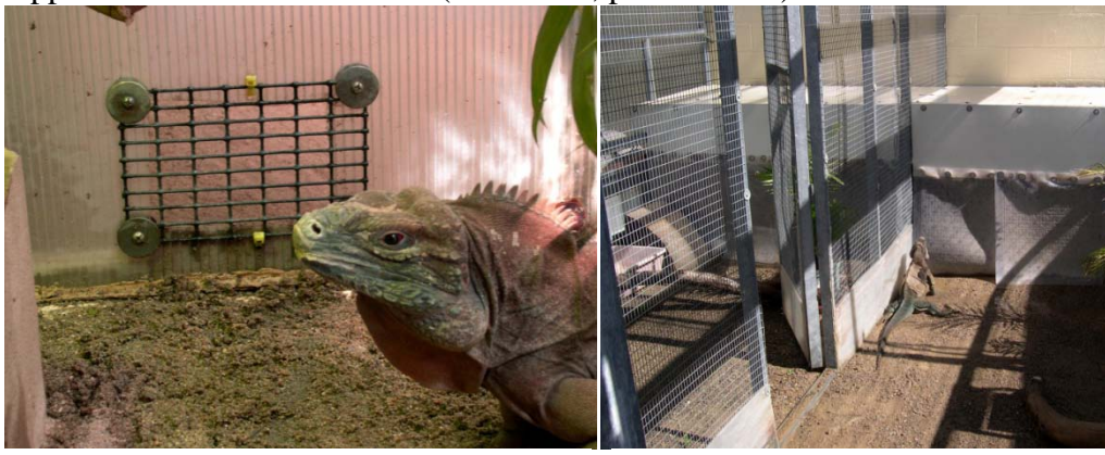
For aggressive species that cannot be housed together outside of the breeding season, small windows between cages will allow for visual and olfactory contact.

to nesting failures include nutrition and incubation practices. At the Durrell Wildlife Conservation Trust, egg mortality was high in I. delicatissima until animals were supplemented with vitamin D3 (R. Gibson, pers. comm.).