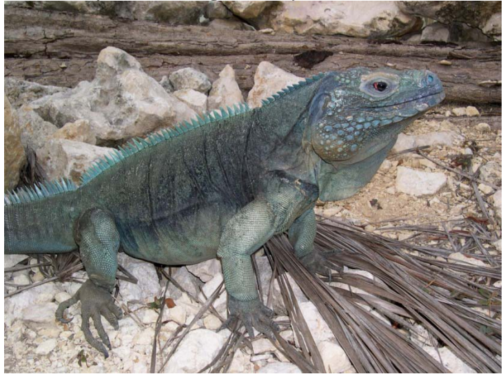
Male Grand Cayman Blue iguana (Cyclura lewisi)

Grand Cayman Blue iguana (Cyclura lewisi)