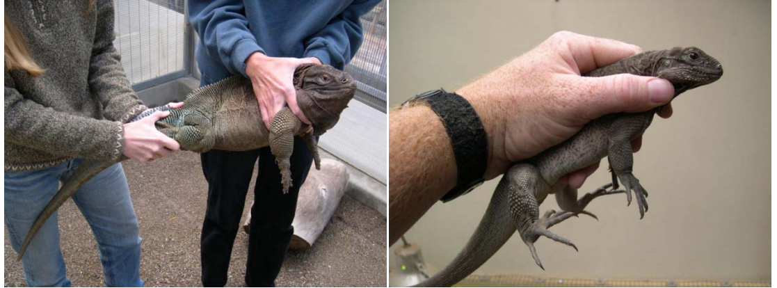
Two-person hold of a large iguana.

Hatchling iguanas should be restrained in the middle of the body with the head secure. Larger juvenile and adult iguanas should be restrained with two hands. One hand should lightly yet firmly grasp the animal behind the head, either in the neck or shoulder region to prevent the animal from turning and biting. The second hand should be placed over the pelvic region, keeping a firm grasp on the rear legs to prevent scratches to the hand or arm that is restraining the head. The tail of the iguana is also a powerful weapon and can be restrained under the arm of the hand that is grasping the rear legs. In many cases it is easier to restrain the tail and one of the rear legs using the same hand. When possible, large iguanas should be restrained by two people, with one person holding the head and a second individual holding the hindquarters of the animal. During measurements of larger iguanas, some keepers and field researchers have found that blindfolds such as elastic knee bands placed over the entire head of the animal work well to calm the animal and keep it from attempting to bite. This technique will also help protect the person taking measurements as many species of iguana will keep the mouth agape during restraint and any hand movement near the mouth may result in a bite. In addition, many researchers simply turn an iguana over on its back, which generally quiets the animal significantly, even if it is highly agitated.