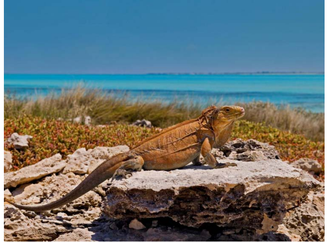
San Salvador iguana ( Cyclura rileyi rileyi )

San Salvador iguana (Cyclura rileyi rileyi)