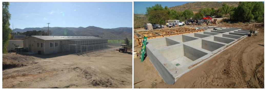
The new Griffin Reptile Conservation Center at the San Diego Zoo Institute for Conservation Research (ICR). Animals from the old CRES enclosures (San Diego Zoo) were moved to the Griffin Center at the San Diego Zoo's Wild Animal Park in 2009.

use a guillotine door to access the outside enclosure. Guillotine doors are also utilized between cages to introduce animals during the breeding season. Each enclosure is planted with native Caribbean plants, and the indoor sections are equipped with a basking area utilizing Active UV heat bulbs and natural sun filtered through Acrylite OP-4 skylights.