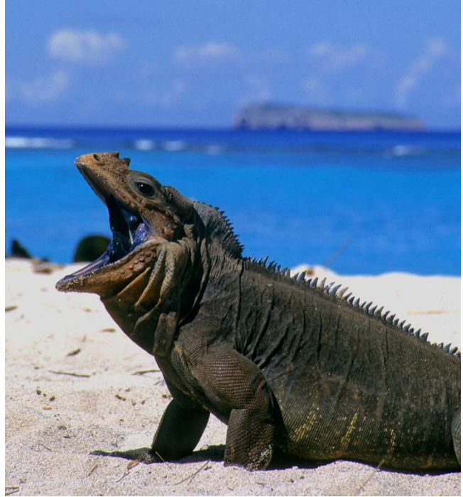
Mona Island iguana (Cyclura cornuta stejnegeri)