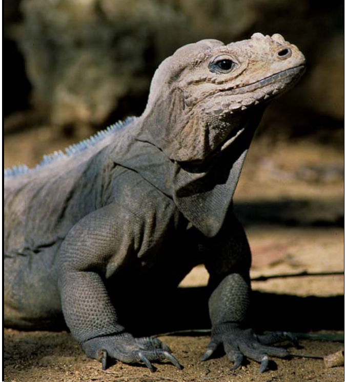
Adult female Rhinocerous iguana (Cylura cornuta cornuta)

Rhinoceros iguana ( Cyclura cornuta cornuta )