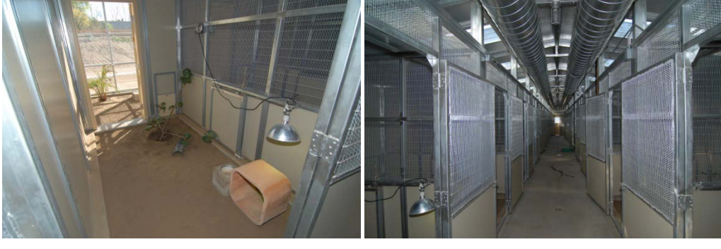
Iguana enclosure at Griffin Reptile Conservation Center showing indoor-outdoor cages planted with native Caribbean plants and palms.