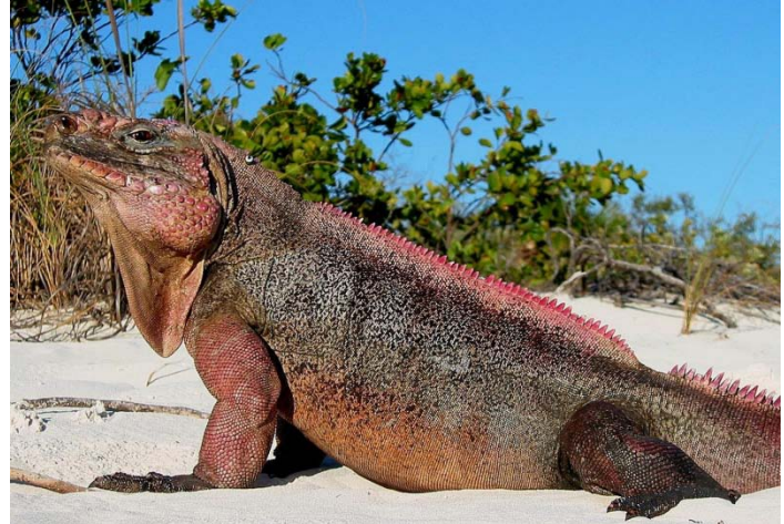
Male Andros Island iguana ( Cyclura cychlura cychlura )

Geographic range: Exuma Islands, Bahamas