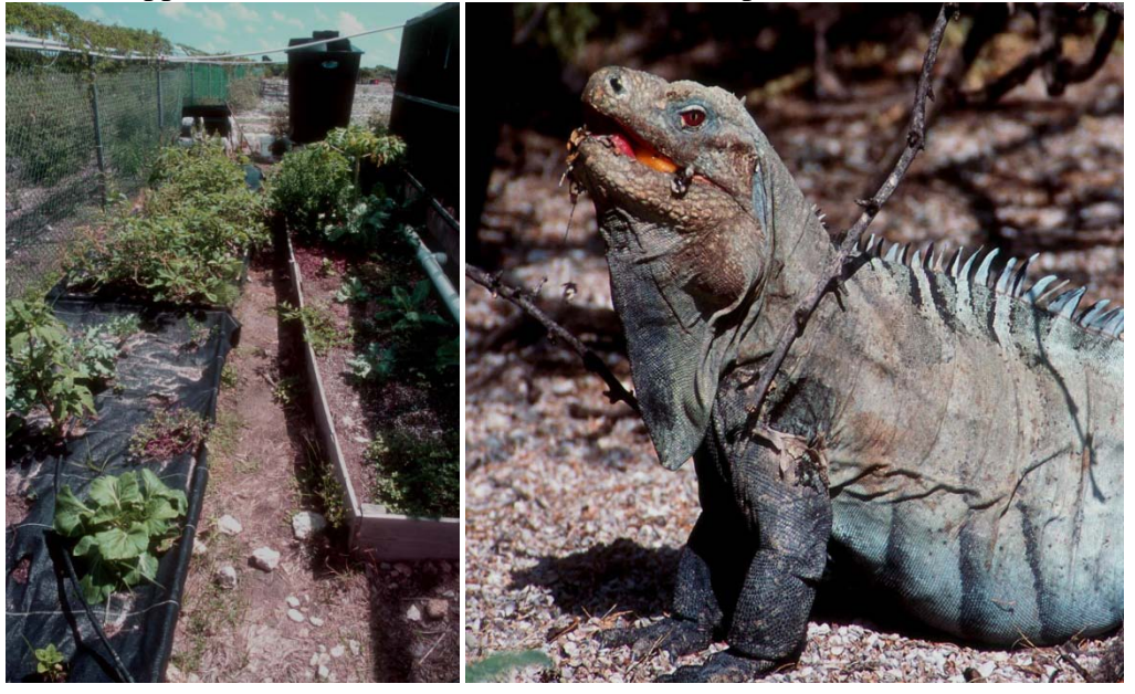
Native plant food garden for headstarted iguanas in Anegada.

Table 8 includes the nutrient analysis of plant parts consumed by some free ranging Cyclura spp. Dry matter content varied greatly with incomplete seed removal for some fruits, possibly resulting in higher values for many nutrients than those levels utilized by the iguana. However, though not completely digested by the iguana, parts such as seeds and skins of fruits, and undigestible leaf fractions probably play a role in maintaining integrity and health of the gastrointestinal tract by their physical form. These data suggest fruits consumed are low to moderate in protein, containing less than 9% protein on a dry matter basis (DMB), while leaves and flowers are moderate to good sources of protein at 9-17%, DMB. Though samples sizes are limited, and large variation exists, it appears flowers contained similar levels of protein and fiber as leaves.