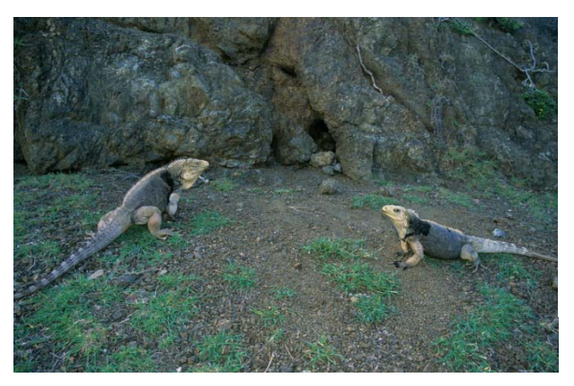
This pair of wild C. n. nubila shares the same burrow throughout the year. This photo was taken in the month of December, showing that some animals may develop pair bonds.