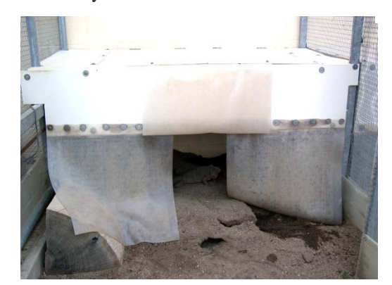
Nesting area being used by C. collei at CRES, San Diego Zoo. The house is heated by 2 Pearlco ceramic bulbs.

Cyclura typically only lay one clutch of eggs per year, and some species may skip a year of reproduction under wild conditions (Iverson et. al , 2004). However, Burton (2004) mentions double-clutching in female C. lewisi in the same year. Multipleclutching is often fairly common in captivity. At ICR we have seen female C. n. nubila lay up to three clutches in a single season (April-October), usually spaced 2-2.5 months