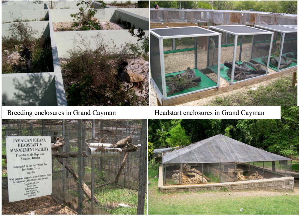
C. collei headstart facility at the Hope Zoo in Kingston, Jamaica