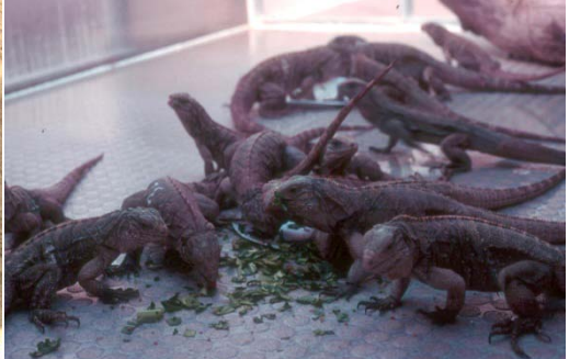
Hatchling iguana food should be finely chopped. Some species of iguanas can be kept in large groups without any major difficulties. This group of C. n. nubila was one of the first to test the theory of headstarting.