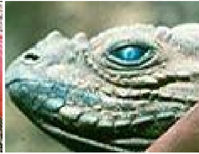
Keratitis in an adult Mona iguana.