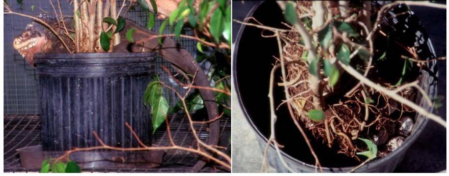
Female I. delicatissima nesting in a potted Ficus tree.

plastic tub that was filled with soil and elevated about 5 feet off the ground (again, the female ignored the spacious nesting area on the floor). Two eggs developed to full-term and died and all the other eggs appeared infertile. Fertile eggs at Durrell were incubated in a mixture of water and vermiculite (1:1, by weight) at 82.4 - 86 ° F (28 - 30 °C) for 93-96 days. Hatchlings can be housed and raised much like Cyclura or I. iguana and Gibson (pers. comm.) believes hatchlings feed and fare better in social groupings.