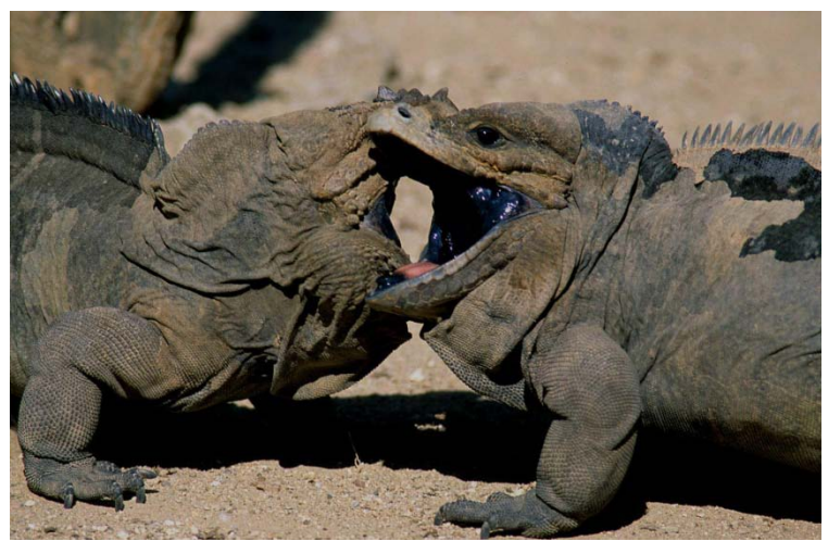
Adult male iguanas should never be housed together. Fights will usually occur leading to severe injuries. This is a pair of C. c. cornuta in combat.

Enclosures should be designed so animals can be separated if needed. Two smaller enclosures with an access door attaching the two enclosures have proven useful at some facilities. In headstart facilities, smaller animals may become stressed near larger animals or may be constantly harassed by them. Smaller animals should be moved into cages with smaller conspecifics or by themselves. Animals that are thin, show small injuries and scrapes on the neck, side, or feet, or constantly hide, are candidates for cage moves in group situations. Injured or sick animals should always be housed by themselves, and when being re-introduced to a cage with one or more animals should