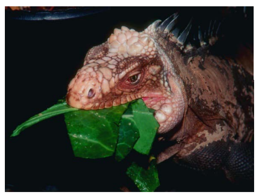
Adult I. delicatissima prefer greens and leaves that are large in size.

Wild I. delicatissima have an extended breeding season and gravid females can be found from February to August. More than one clutch per year may be possible, but most captives only lay a single clutch per year. Breeding and oviposition have been observed at Durrell Wildlife Conservation Trust, San Diego, and Memphis Zoo since 1994; however, success has been limited at the latter two institutions. At ICR, animals are sometimes separated for part of the year and mirrors have been used to stimulate the male. Temperature and light cycle manipulation seem to be the main reproductive triggers in captives.