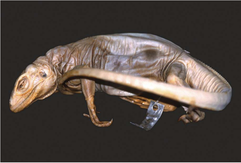
Navassa Island iguana ( Cyclura cornuta onchiopsis ) specimen.

*Navassa Island iguana ( Cyclura cornuta onchiopsis ) *NOTE: Some authors classify onchiopsis as a full species based on meristic differences and isolation.