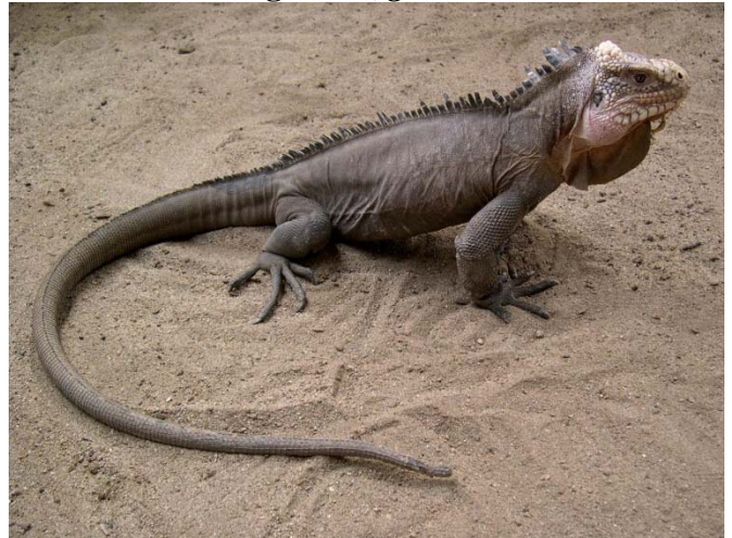
Male Lesser Antillean iguana (Iguana delicatissima)

Geographic range: Numerous islands in the Lesser Antilles