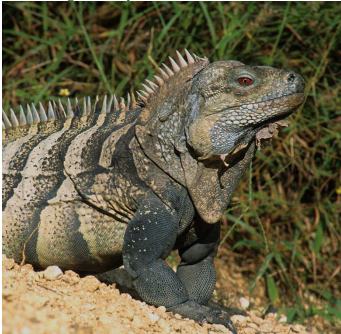
Adult male Ricord's iguana (Cyclura ricordii)

Geographic range: southwestern Dominican Republic and Southeastern Haiti Adult size: males up to 49.5 cm SVL; females up to 43.0 cm SVL Dietary notes: primarily herbivorous Size/age at sexual maturity: 2-3 years of age Time of mating: May Time of oviposition: first rainy period in May or June Nesting parameters: nests in fine, sandy soils; egg chamber depth about 40 cm. Number of eggs: up to 18 Temperature/duration of incubation: 30-31 ° C (86-87.7 ° F)/95-100 days Egg size: unknown Hatchling size: 8.74 cm SVL and 30.0 g Growth rates: unknown References: Ottenwalder, 2000b.