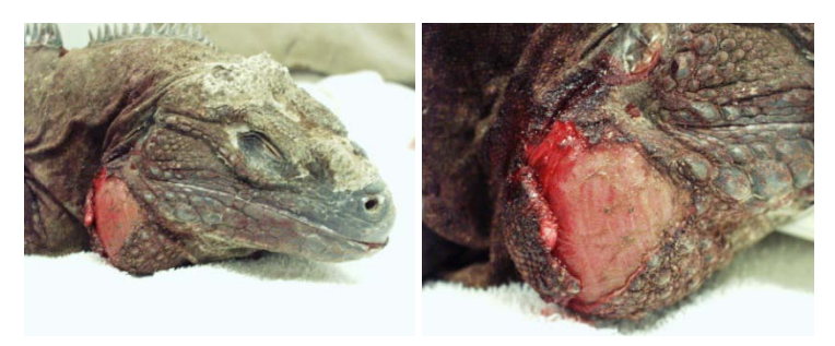
Male Jamaican iguana suffered a degloving injury on both sides of his face during a conflict with another adult male. Photo on the right shows a close up of the injury with the underlying facial muscles exposed.

Lacerations from bite wounds are common. If they are attended to the same day, lacerations can be cleaned and sutured, giving the best outcome. Wounds that are identified more than several hours after occurrence need to be managed as open wounds. This involves thorough cleaning and debridement, as it is common for the wounds to be packed with dirt and other exhibit materials. Systemic antibiotics should be used to control infection at the site of the injury. Wounds should be monitored closely, as many develop complications such as abscessation, necrosis of digits or tails. Subsequent amputation of digits, limbs and tails may be necessary due to infection or loss of blood supply.