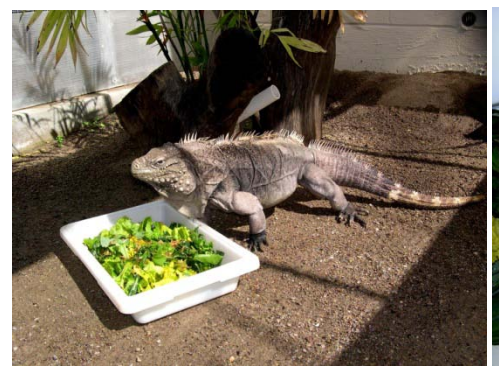
A large C. n. nubila feeds from a dish. Adult animals should be fed daily and will eat as much as 1000 grams of food a day.