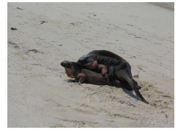
A pair of Allen's Cays iguanas ( C.c. inornata ) copulating in the wild.

To achieve nesting success, nesting areas should be deep, spacious, and warm (85-87 ° F/29.4-30.6 ° C) with optimal soils. Ideally, the substrate throughout the cage should be at least three feet deep so females may choose to nest in a variety of places. At many facilities, especially off-display areas, this depth of substrate is not possible. In this case, built-in nestboxes, constructed to be as large as possible should be used. At ICR, nestboxes measuring 4' x 4' x 3' high (1.2 m x 1.2 m x 0.9 m) have been used with some success. Further, plastic nestboxes, made from large Rubbermaid® or other boxes, have worked for some species. However, these nestboxes are usually only successfully used by young animals or first-time breeders for the first year or two, followed by below-average nesting (J. Lemm, pers. obs.). Indianapolis Zoo has had nesting success with Rubbermaid® tubs that are completely buried in sand substrate. Animals enter these tubs by digging down and entering a hole cut in the side of the tub.