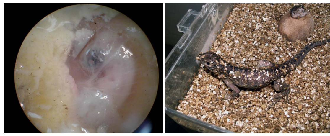
Viable C. collei embryo inside the egg.