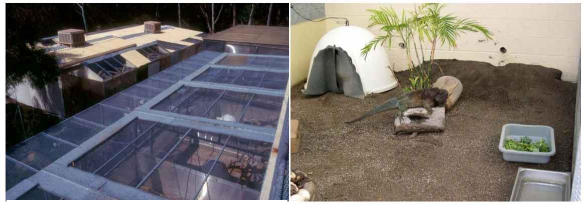
Above view of indoor and outdoor iguana enclosures at San Diego Zoo.

Five outdoor iguana yards with adjacent inside holding are featured at the Fort Worth ARCC facility. Species targeted for captive breeding include the Jamaican and Anegada iguanas.