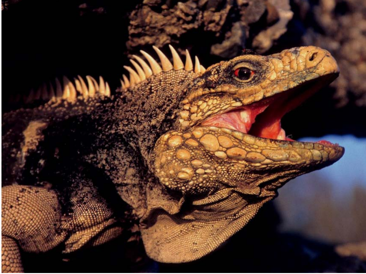
Adult male Cuban iguana ( Cyclura nubila nubila )

Geographic range : offshore cays of Cuba and in isolated protected areas on the mainland; an introduced population exists on Isla Magueyes, Puerto Rico.