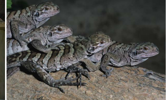
These four C. pinguis were the first hatched at CRES, San Diego Zoo.