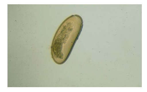
Oxyurid ova from Cyclura fecal flotation. 190 x 171 \mu m, 160x

Protozoa, including coccidia and Entamoeba , can be responsible for significant morbidity, including poor weight gains or weight loss, enteritis and malabsorption. Coccidia can be a frustrating problem in reptile hatchlings housed in high density, though specifically in Cyclura facilities this problem has not been identified. Good husbandry practices are the first line of defense. Clinical cases can be treated with sulfa-based coccidiastats such as sulfadimethoxine. Such treatment will reduce the load of coccidia and improve the health of the iguana, but is unlikely to eliminate the infection. The drug ponazuril has shown potential to clear coccidial infections in mammalian species. Its safety and efficacy in lizards has not been evaluated. Good husbandry is the answer to this disease problem.