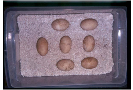
Egg incubation box for C. pinguis at CRES, San Diego Zoo.

If breeding, nesting, and incubation were successful, hatching success is usually quite high. When full-term, healthy-appearing young pip and die or fail to pip, a probable cause of death is adding too much water to the egg boxes during the final weeks of incubation (J. Lemm, pers. obs.). Hatchlings commonly stay in the egg for up to a day with just their heads sticking out. Wild nest temperatures for C. collei have been measured and fluctuate from 83.3 - 92.3 \degree F (28.5 - 33.5 \degree C) . Wild C. pinguis nests range from 83.1 - 91.2 \degree F (28.4 - 32.9 \degree C) . While successful incubation has been recorded at both extremes of these ranges, the recommended protocol above represents the mean in which hatchlings can be expected to emerge with their yolk sacs absorbed.