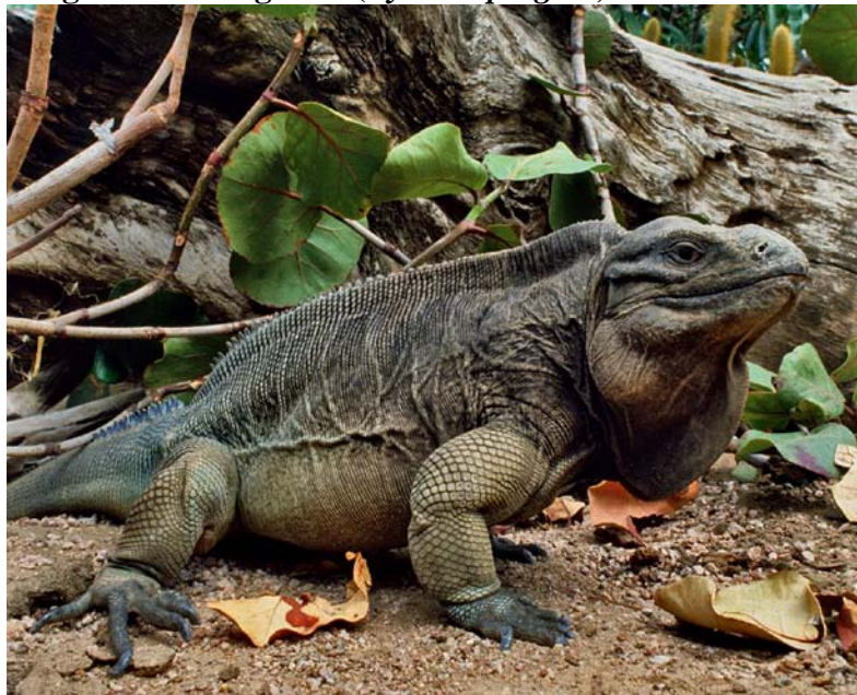
Adult male Anegada Island iguana (Cyclura pinguis)

Geographic range: Anegada, Guana, Necker, and Norman Islands, British Virgin Islands