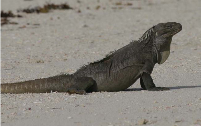
Bartsch's iguana ( Cyclura carinata bartschi)