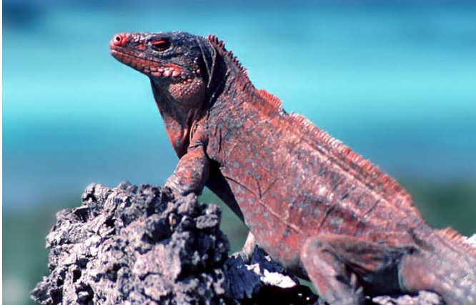
Adult Acklin's iguana ( Cyclura rileyi nuchalis )

Geographic range: islands of Acklins Bight, Bahamas Adult size: unknown Dietary notes: primarily herbivorous; probably takes some animal matter. Size/age at sexual maturity: females reach maturity at 19.5 cm SVL and 260 g. Time of mating: unknown, but probably May-June Time of oviposition: unknown, but probably June-July Nesting parameters: nests in sand burrows 69-235 cm in length. Egg chamber is 14-40 cm deep. Number of eggs: avg. 3.1 Temperature/duration of incubation: 30 ° C (86.0 ° F) Egg size: 55.5 mm x 30.2 mm; 27.1 g Hatchling size: unknown Growth rates: unknown References: Hayes et al. , 2004; Thornton, 2000.