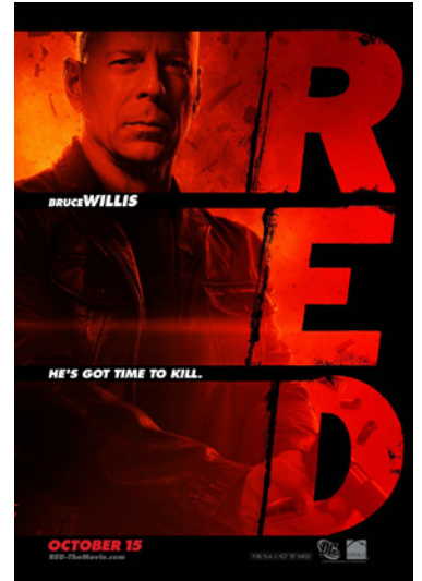
RED teaser poster

Starring Willis, John Malkovich, Mary-Louise Parker, Morgan Freeman, Helen Mirren and Karl Urban, RED shot interiors in Toronto before relocating to New Orleans for the majority of its exteriors, including a major location in the swamp, St. Vincent's Guest House on Magazine Street, and North Peters at Decatur.