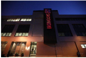
Second Line Stages

Just as it has played an important role in New Orleans recovery from Hurricane Katrina, the film industry is looking to lead the way on environmental conservation efforts. On October 28, producers and experts in eco-friendly techniques will gather at Second Line