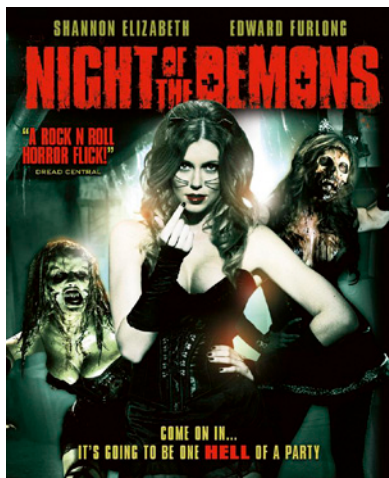
Diora Baird on the UK DVD cover

Night of the Demons premieres next Tuesday on DVD.