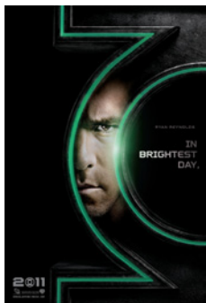
Official teaser poster