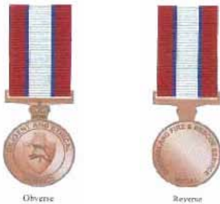
Diligent and Ethical Service Medal Front and Back

The Diligent and Ethical Service Medal is a circular matt bronze medal ensigned with the crown of St. Edward. The front of the medal portrays a firefighters helmet and crossed axes within a central shield. Surrounding this are the words ‘Diligent and Ethical Service’ for which the award is granted.