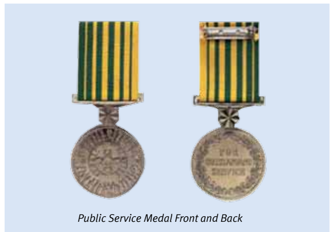
Public Service Medal Front and Back

The Public Service Medal is a circular nickel-silver medal ensigned with a Federation Star. The front of the medal shows an inner circle with four planetary gears spaced equally around a sun gear. It is surrounded by the words 'Public Service'. An outer circle shows 36 human figures symbolising a range of occupations and activities.