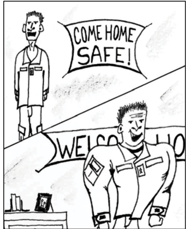
"The GTMO Effect"