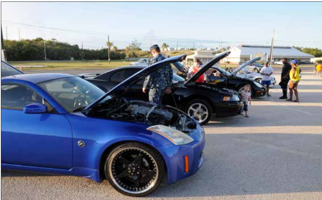
A lineup of high-end cars are inspected and judged during the first-ever Morale, Welfare and Recreation auto show held at the Downtown Lyceum Nov. 23. The idea behind the auto show was to mirror events held stateside that people enjoy and to bring a little slice of home to the island.