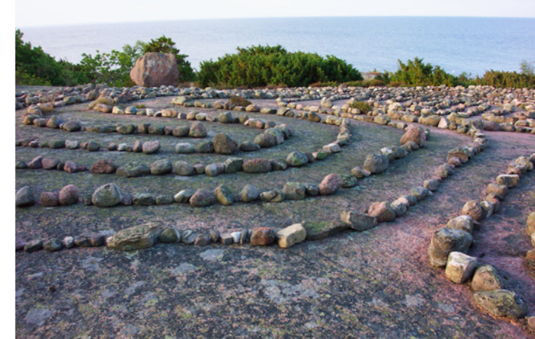
The Trojeborgen maze is one of the largest and most impressive in Scandinavia. Old texts and oral narratives reveal that mazes were often connected with magic. Along with Eastern traditions, people walked certain routes through the maze in the hope of improved fertility and fishing luck.