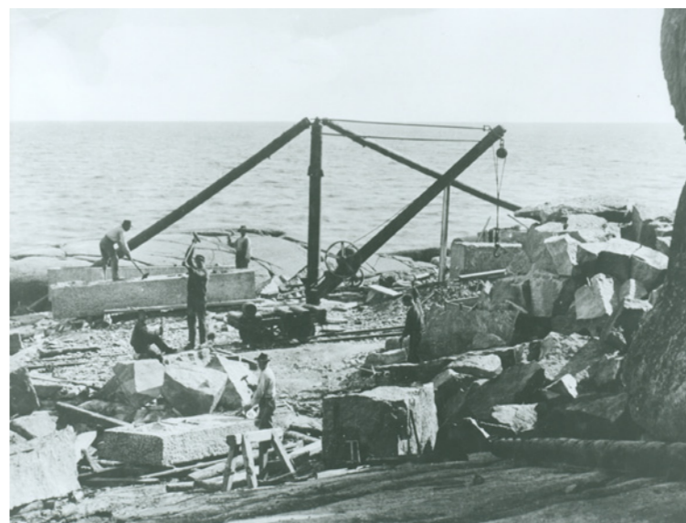
Snapshot from one of the pits where stone was quarried in the early 20th century for export to Germany and other countries.