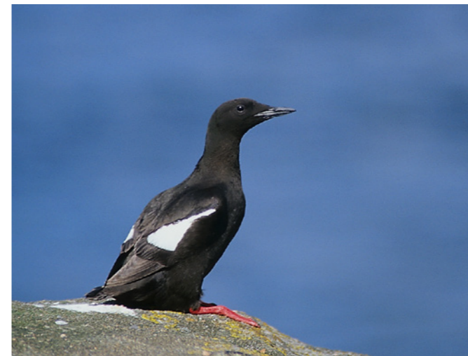
Black guillemot is the signature bird of the island.