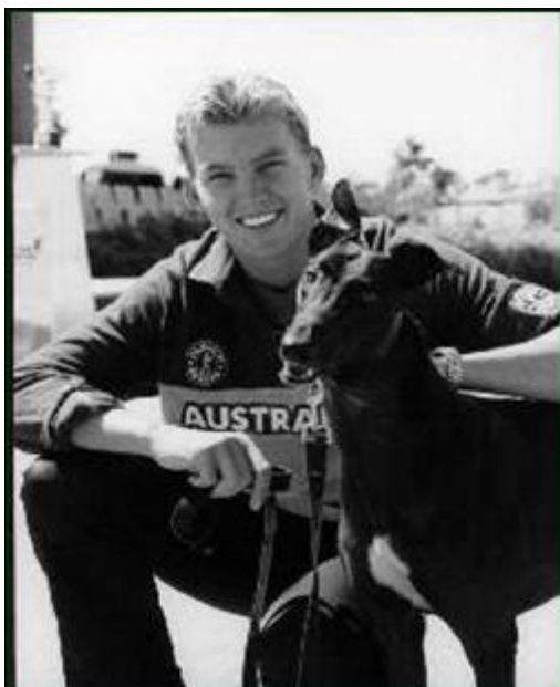
Brett Lee with 'Brett Lee'