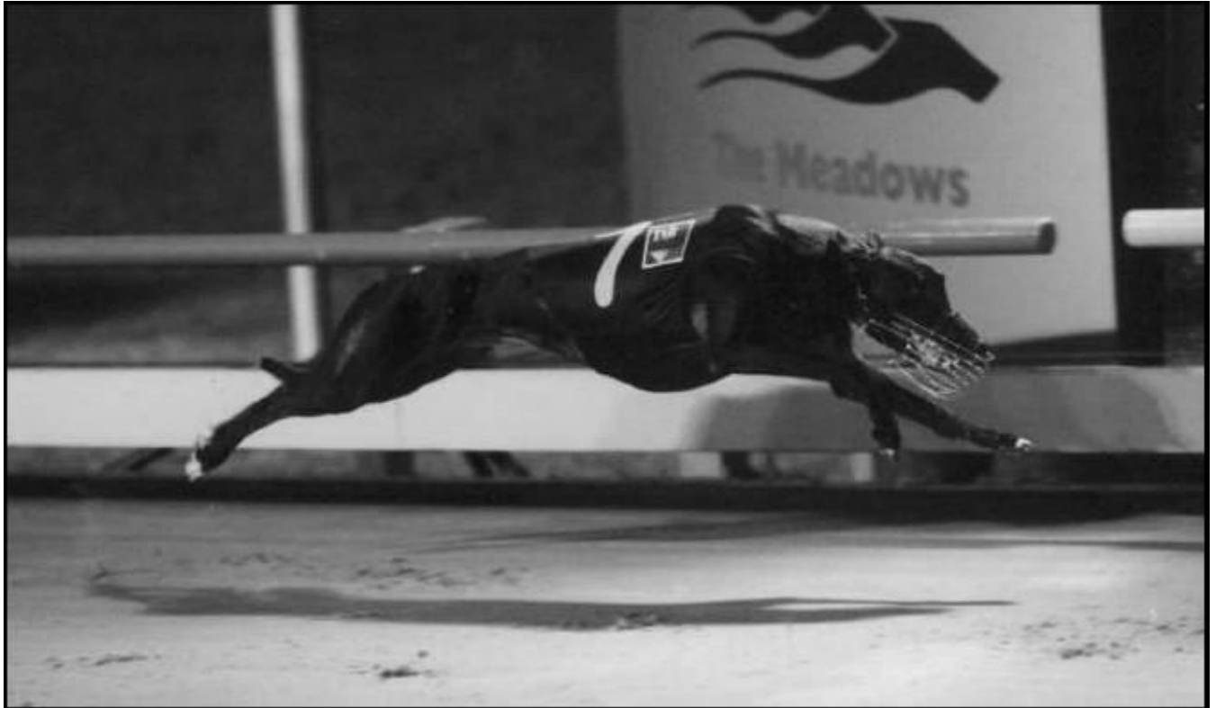
The mighty Brett Lee in full flight

After an injury set back suffered at the Meadows and a shock defeat in the Hobart 1000 final when he was run down by Top Shiraz, the champion put together a stunning sequence of 12 wins amassed five Group 1 victories all between January 11 and May 2 2001. He won the Interstate Challenge (Angle Park), Adelaide Cup, Australian Cup, Maturity Classic, Golden Easter Egg and the Warrnambool Classic. During his brilliant career Brett Lee established seven track records: The Meadows (518m) - 29.43, Angle Park 28.88 (515), Horsham (480m) - 26.94, Shepparton (440m) - 24.22, Geelong (457m) - 25.19, Ballarat (450m) 24.95, and Warragul 424-metres - 23.68.