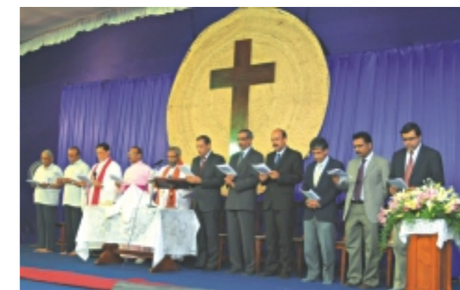
Commissioning Service of the new Director and Administrators