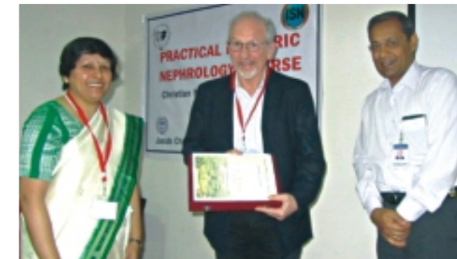
First Practical Paediatric Nephrology