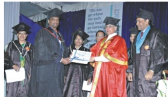
College of Nursing Graduation