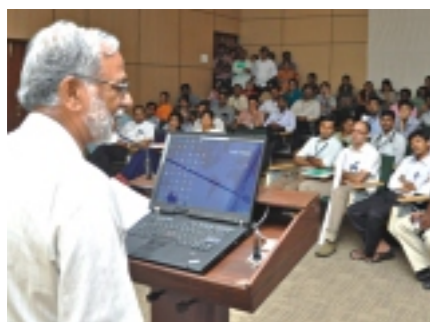
Third Annual Research Day