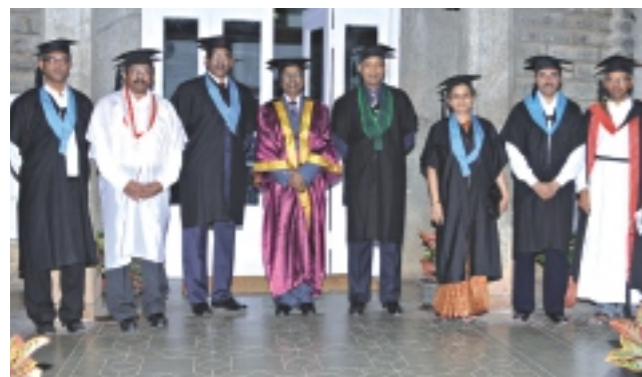
Allied Health Sciences Graduation