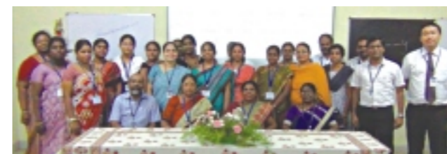
Workshop on Specific Learning Disorders