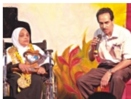
20th Rehab Mela