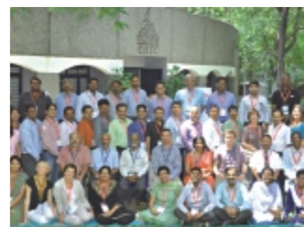
Third Advanced Vaccinology Course