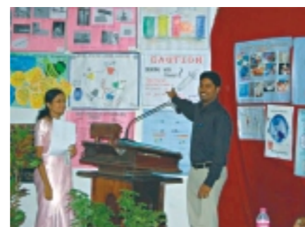
Infection Control Week