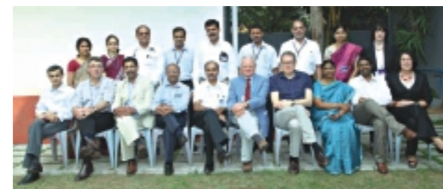
CME on Colorectal Cancer