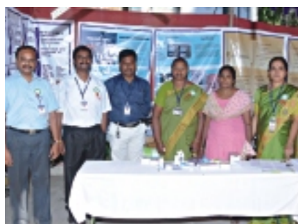
National Pharmacy Week