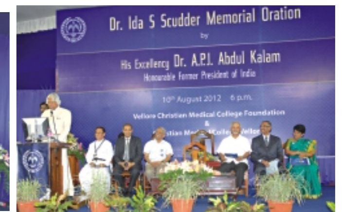
Dr. APJ Abdul Kalam delivers the First Dr. Ida S. Scudder Memorial Oration