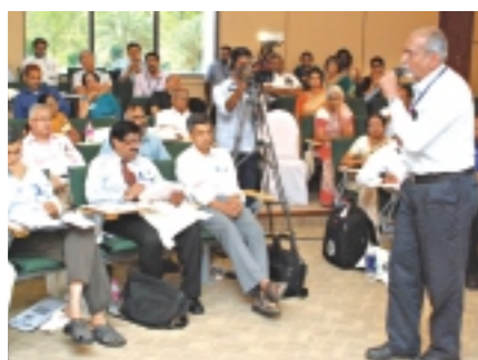
Workshop on Linking Education and Health Care - The CMC Experience