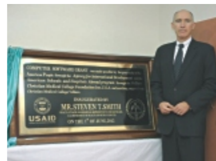
Computer Disaster Recovery Management Grant (USAID ASHA)