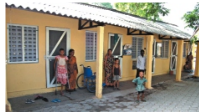
Renovated Facilities at Chatram - A gift from the MBBS batch of 1970