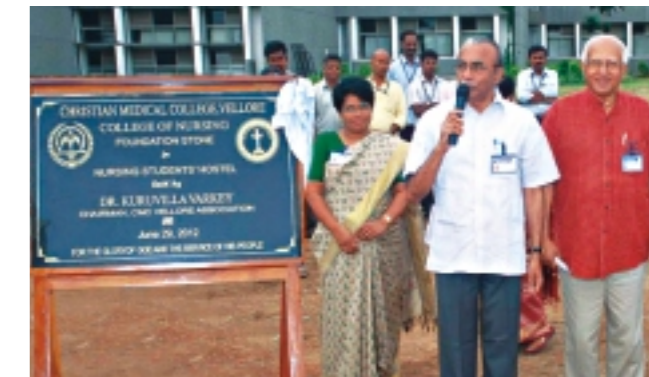
Laying of the Foundation Stone of the Student Nurses' Hostel, Kagithapattarai Campus