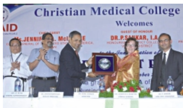
Dedication of Sewage Treatment Plant