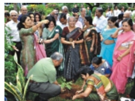
Medical Alumni Reunion