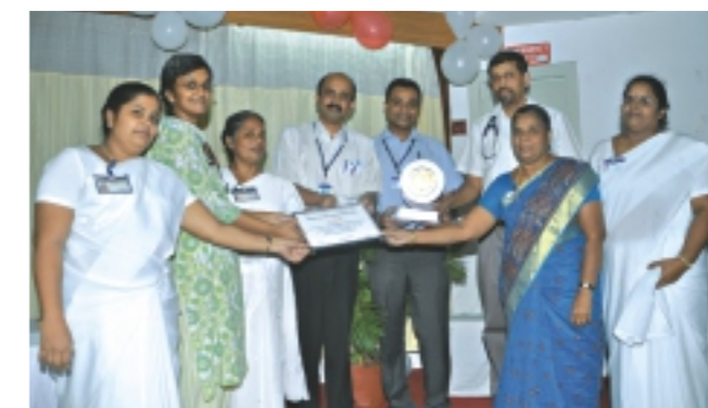
'E' Ward - Most Patient Friendly General Ward