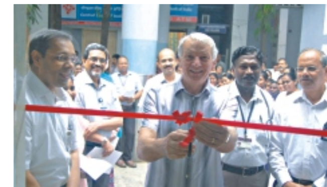
Dedication of Trauma Bay