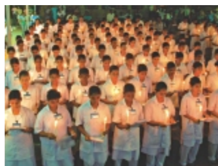
CON Lamp Lighting Ceremony