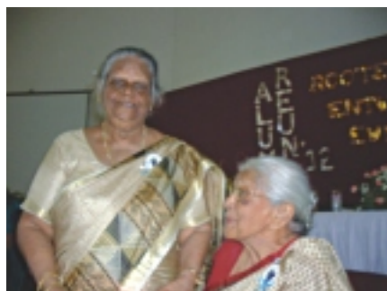
College of Nursing Alumni Reunion