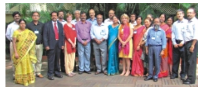
RUHSA Symposium on Access to Cervical Cancer Screening in India