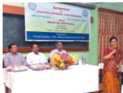
Symposium on Inborn Errors of Metabolism