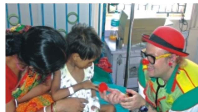
Humanitarian Clowns Visit CMC