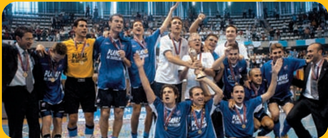
Spain's Playas de Castellón FS have won the first two editions of the UEFA Futsal Cup.