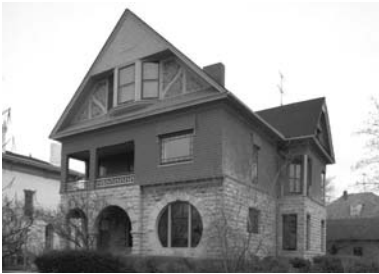
#18 FREDERICK J. GOTTFREDSSEN HOUSE 711 – 61st Street (1888) Queen Anne