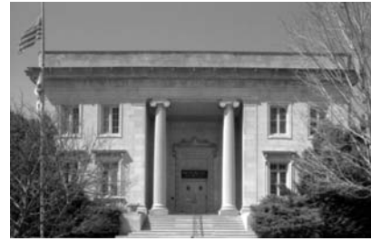
#20 JEWISH COMMUNITY CENTER BETH-HILLEL TEMPLE 6050 – Eighth Avenue (1927-28) Neo-Classical

third-story built of brick under a hipped roof. Two Ionic columns support a partially enclosed entrance portico. The Masons have been meeting in Kenosha since the mid-nineteenth century.