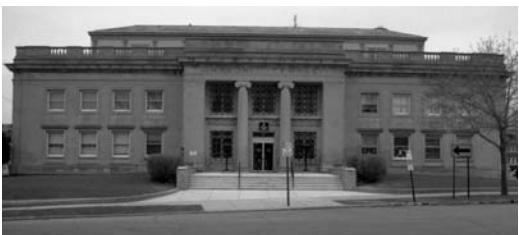
#19 MASONIC TEMPLE 807 – 61st Street (1924) Neo- Classical Revival