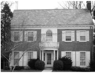
#12 WILLIAM T. FLATLEY HOUSE 521 – 61st Street (1930) Georgian Revival

One of the last homes to be built in the district is this two-story red brick Georgian Revival style house. Under its gable roof, a modillioned frieze can be seen. The entrance is decorated with sidelights and a fanlight, and is covered with a semi-circular portico supported by plain columns. The portico's frieze is decorated with modillions and topped with a balustrade. Windows are symmetrically placed on the house.