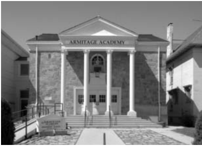
#22 FIRST CHURCH OF CHRIST, SCIENTIST (Armitage Academy) 6032 – Eighth Avenue (1927-28) Colonial

The First Church of Christ, Scientist was built in the Colonial style. The body of the structure is constructed of Vermont seam faced granite trimmed with Bedford stone. The side walls and rear of the church are made of pressed brick.