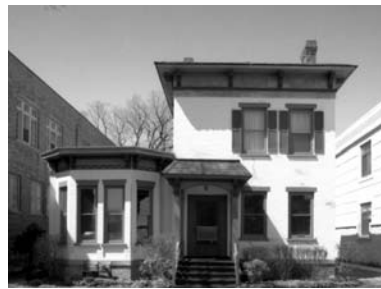
#21 VOLNEY FRENCH HOUSE 6044 – Eighth Avenue (1846) Greek Revival / Italianate

The Jewish Community Center began as the Young Men’s Hebrew Association around 1922. First a social group, the members reorganized as a temple in 1923. The Beth Hillel congregation has been associated with Reform Judaism in Kenosha since the 1920s.