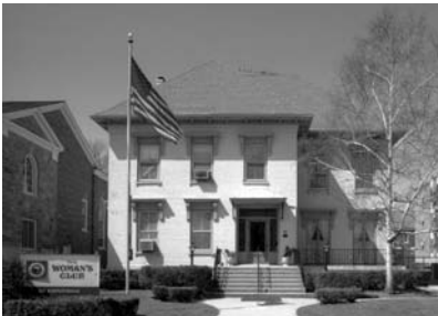
#23 HALE-FARR HOUSE 6028 – Eighth Avenue (1848, remodeled/enlarged 1890) Italianate