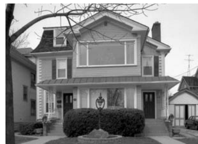
#16 ORSON WELLES BIRTHPLACE 6116 – Seventh Avenue (1880) Second Empire