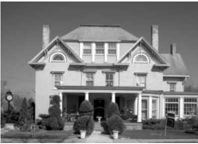
#13 EDWARD BAIN HOUSE 6107 – Seventh Avenue (1860) Italianate