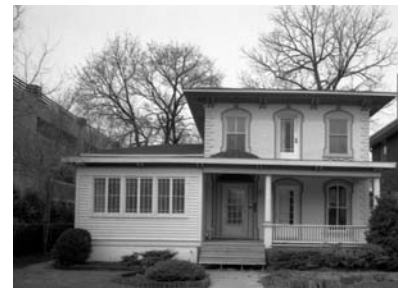
#15 JOHN T. YULE HOUSE 6128 – Seventh Avenue (1866) Italianate

Terrace Court Apartments was built as an apartment complex for middle- and upper-class Kenoshans who wanted a downtown address, but not the upkeep of a downtown single-family residence. Original tenants included doctors, dentists, attorneys, business managers, and other white-collar professionals.