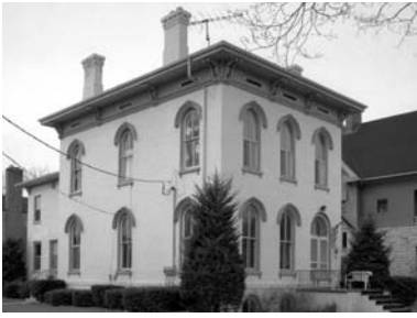
#17 JACOB GOTTFREDSSEN HOUSE 705 – 61st Street (1869-71) Italianate

The Jacob Gottfredsen House is a two-story painted brick Italianate house with a low-pitched hip roof common to the style. Several brick chimneys with elaborate corbeled caps project from the roof. Under the wide overhanging eaves are paired brackets and a decorated frieze. The window openings are all tall, narrow sashes with round arches decorated with heavy hood moldings with keystones. The windows also have sills with small brackets. The east facade features a tall, narrow decorative leaded glass window with an elaborate flat arch.