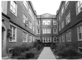
#14 TERRACE COURT APARTMENTS 6207 – Seventh Avenue (1928) Neo-Classical Revival

Library Park is the host of many special events, including Art Fair in Library Park and Food Folks & Spokes. Log on to www.KenoshaCVB.com for a list of Kenosha Area events.