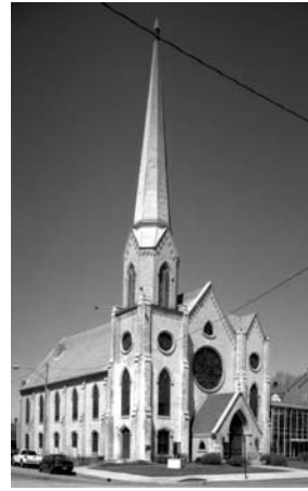
#24 FIRST CONGREGATIONAL CHURCH 5934 – Eighth Avenue (1874) Gothic Revival

More information on the history of Kenosha can be found at the Kenosha History Center on Simmons Island. Visit www.kenosbahistorycenter.org for details.