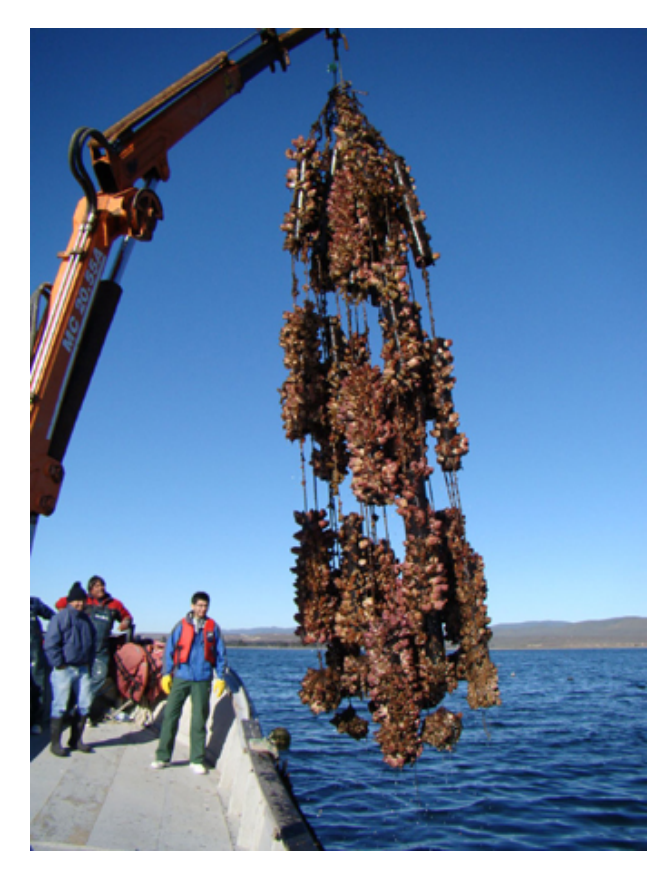
Figure 2. Technological systems used in giant barnacle cultures. Tubular system.

Figura 2 . Sistemas tecnológicos empleados para el cultivo de "picoroco". Sistema tubular.