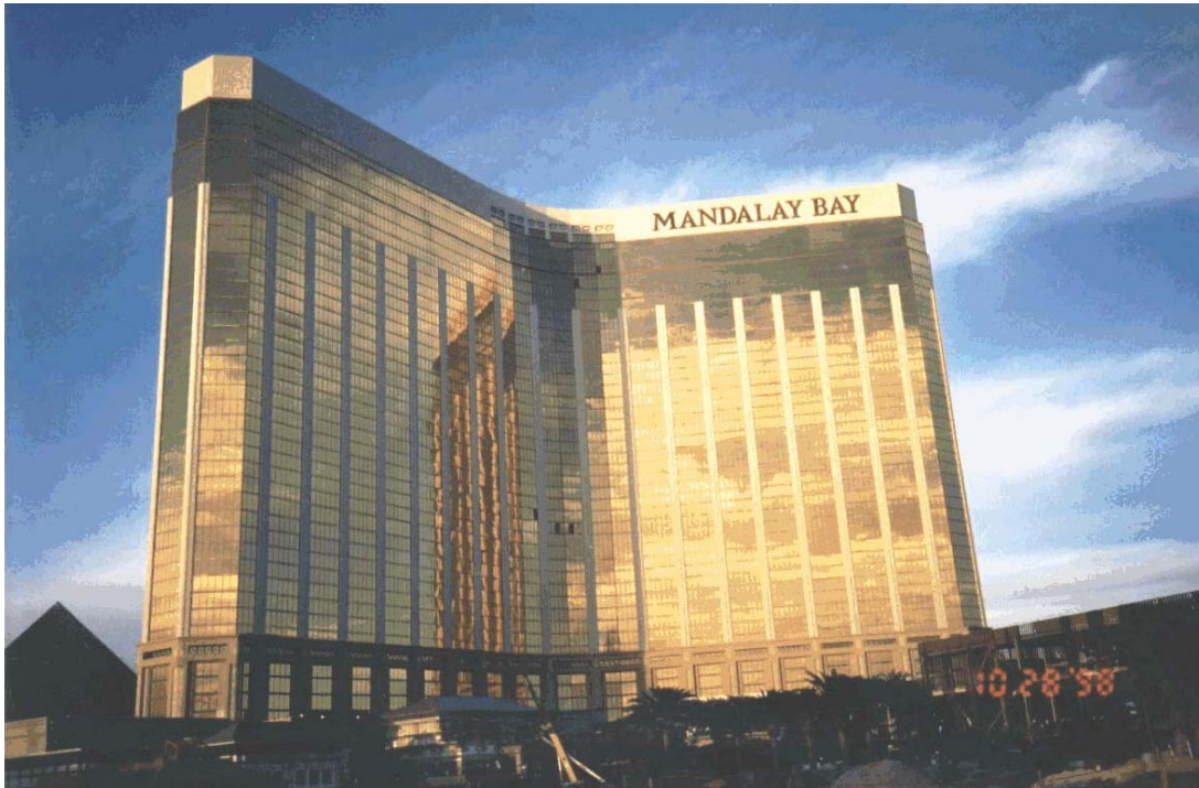
Figure 1. Overall elevation view of Mandalay Bay in 1998.