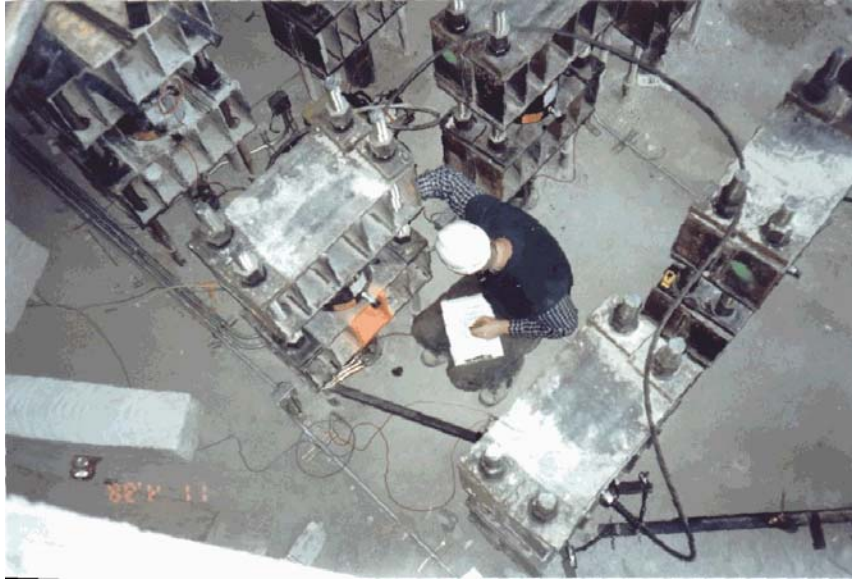
Figure 4. Overhead view of pile attachment frames.

Grout samples were obtained at least once per shift and tested. Under full application of the observational approach, the building was also continuously monitored during micropile construction using level survey and tiltmeters to verify that methods were improving the settlement rate.