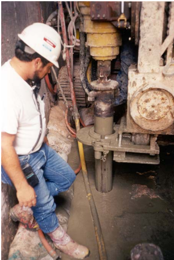
Figure 2. Externally flushing with grout.

Once the casing reached the desired bottom elevation, a flexible tremie pipe was lowered inside the pipe casing to the bottom of the hole. Neat cement grout, mixed in high shear colloidal mixers, with water to cement ratio of 0.45 and a super-plasticizing admixture was then pumped through the tremie pipe. This very fluid grout would often travel a significant distance up the annulus just under the head of the tremie. Finally, full external grouting was completed by attaching the drill head back on the casing, and pumping additional grout through the head of the drill until it was observed to be flowing up from around the outside of the pile (Figure 2). This technique of fully grouting around the pile annulus was developed in order to assure that the potential ground loss that may have been created with the external flush drilling was immediately restored in each case with the grout filling. Additionally, the fully bonded piles proved to act as reinforcement against ground movement, and improved the situation as the installation progressed.