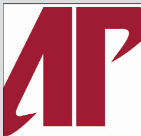
Austin Peay GOVERNORS (9-12, 3-4 OVC)