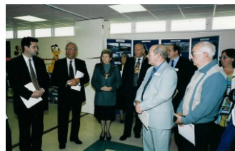
The Old Clinic before 1999 inside and out.