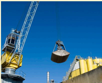
Cargo being worked