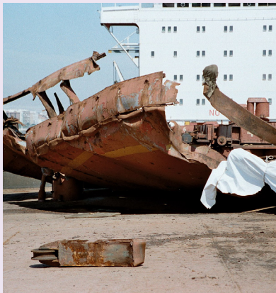
The damage caused by a DRI explosion

Wood products transported in bulk are listed in a new schedule to the Code: Wood Products – General. They include logs, pulpwood, roundwood, saw logs and timber. These cargoes may cause oxygen depletion and increase carbon dioxide in the cargo space and adjacent spaces.