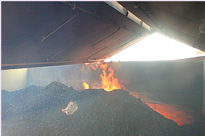
Coal on fire in a cargo hold