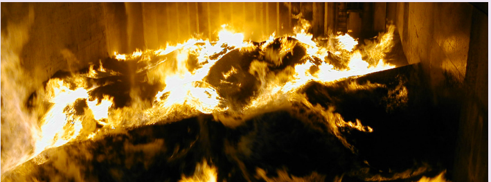
DRI which has self heated

Corrosion can be caused by some Group B cargoes and their residues. A coating or barrier may need to be applied to the cargo space structures before loading. Before loading and unloading corrosive cargoes, make sure the cargo space is clean and dry.