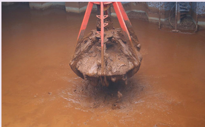
Liquefied nickel ore

You can find the Group for a particular cargo in its schedule.