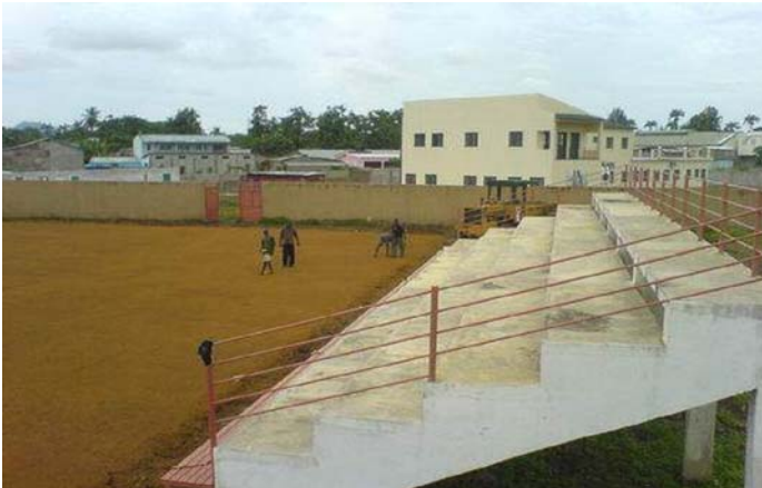
The grass at the national stadium in São Tomé was damaged by the heat and the sun.

Further information on Win in Africa with Africa: http://www.fifa.com/mm/goalproject/WinAF_E.pdf