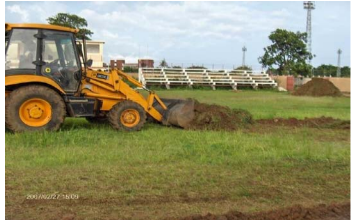
Removal of humus in preparation for the foundations of the new football turf pitch.