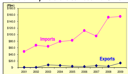
Chart 1 : Fiji Merchandise Trade with China