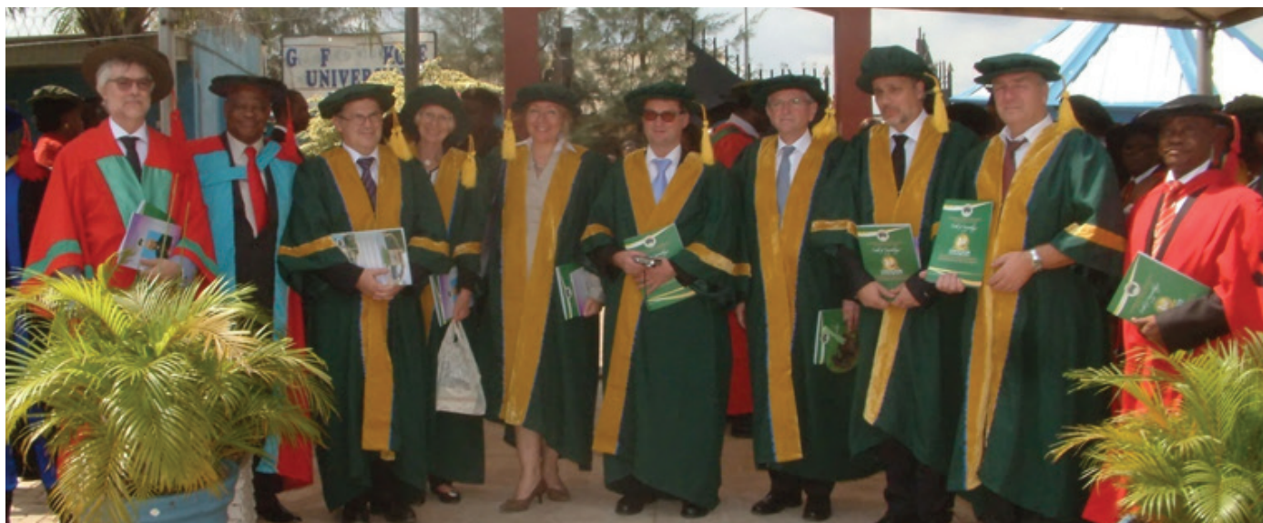
Some international guests at the convocation

The Vice-Chancellor maintained that the religious dialogue, which encouraged students to worship God in their own ways and languages, resulted in the University being one of the safest in Nigeria, emphasising that cultism did not exist in the University. He gave an overview of some of the innovations and successes which the Institution had recorded within its four years of existence.