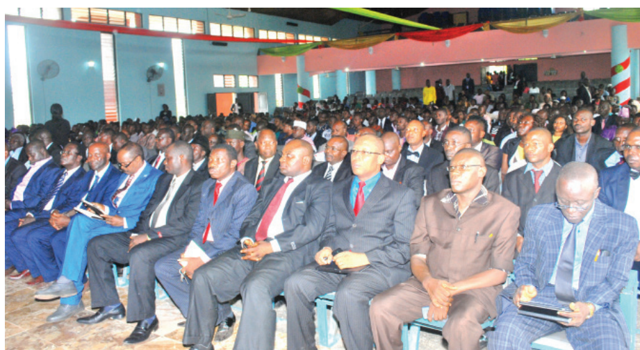
A cross section of guests and staff

Explaining the impact of climate change on Nigeria, Professor Kadiri pointed out that empirical evidence had shown that Nigerian temperatures had kept rising and rainfall had decreased since 1901. Similarly, recent study by the Department for International Development (DfID), predicted a possible rise in sea level in 1990 up to 0.3m by 2020, 1m by 2050