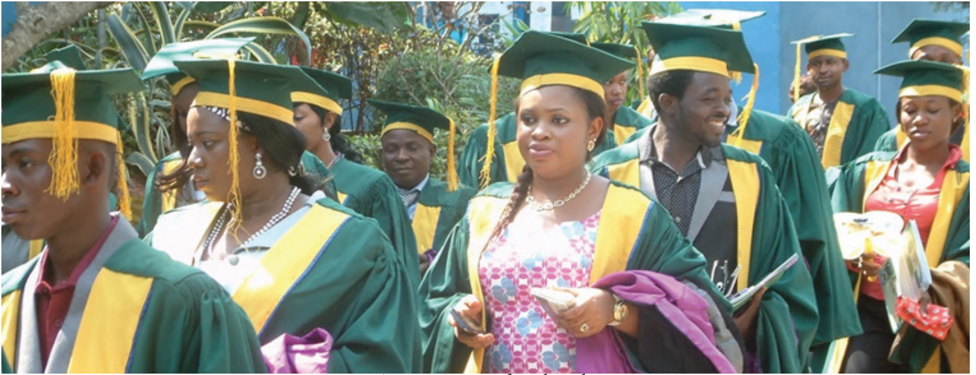
A cross section of graduands

award of Bachelors' degrees to 100 young men and women,