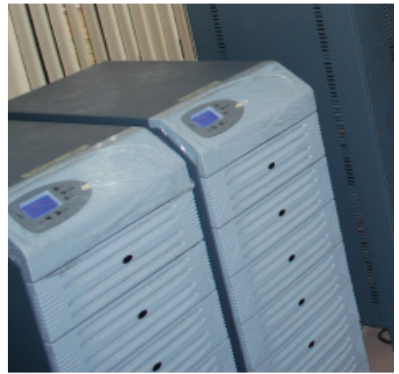
The Power back-up facility