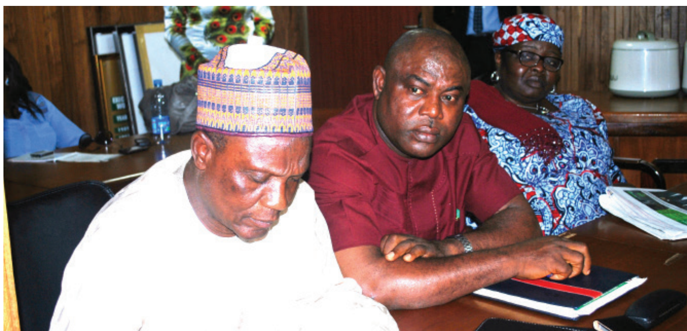
R-L: Representatives of NASU, SSANU and NAAT