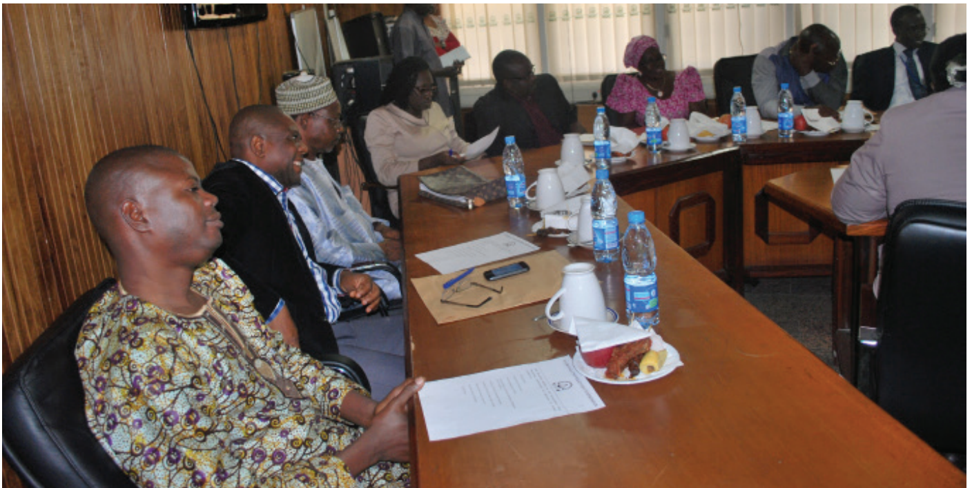
Some of the Gerontology and Geriatrics scholars