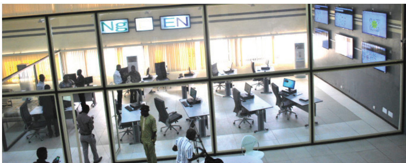
The NgREN secretariat