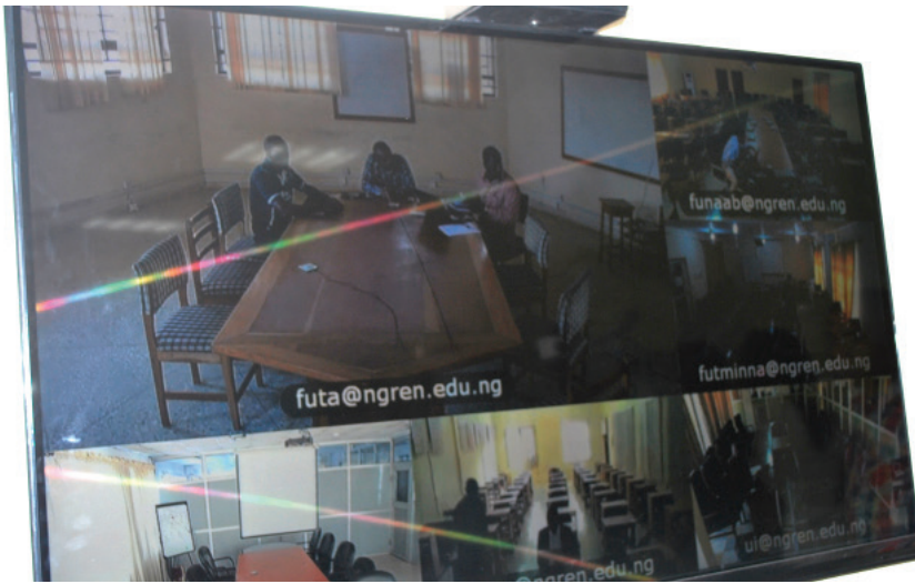
The video conferencing screen