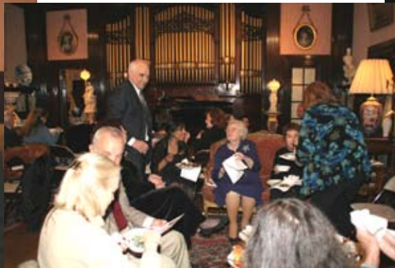
An excited crowd at the recital in 2006