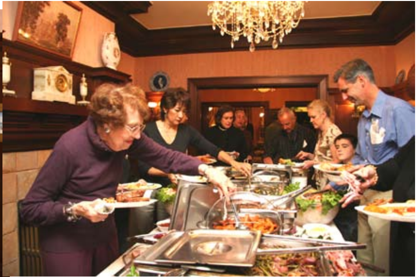
A November Feast