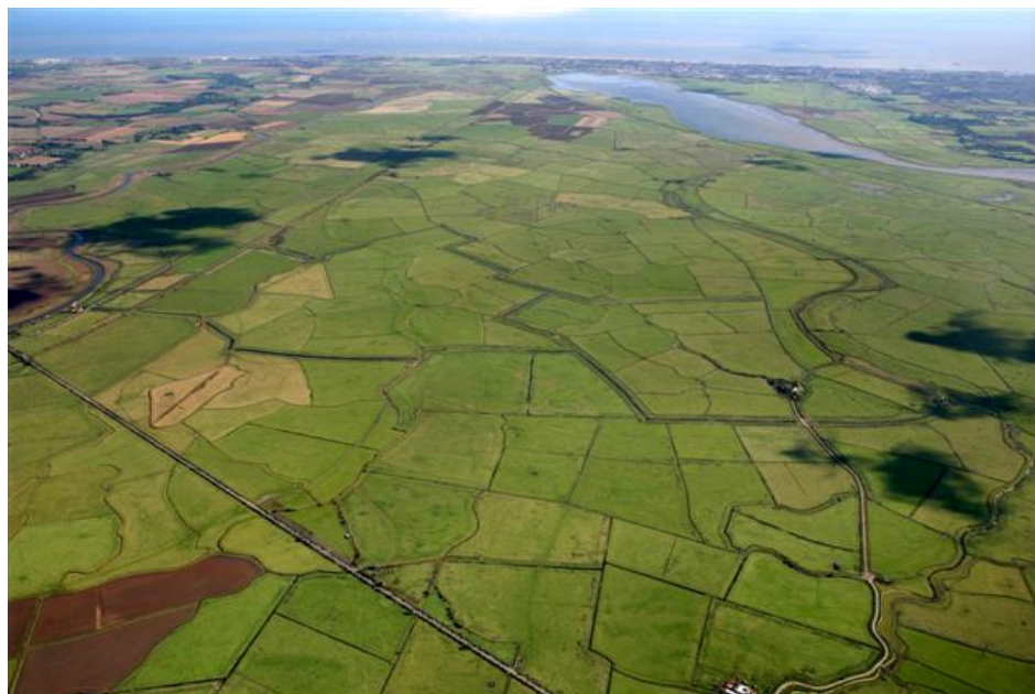
1. Part of the Halvergate Marshes from the air

Survey Points: TG 44470664; TG 43810480; TG 42270925