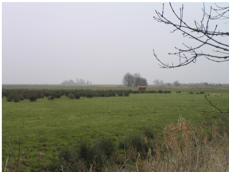
3. Marshes to the south of the Stone Road

The huge numbers of Scots cattle being fattened up on the marshes provoked comment from travel and agricultural writers during the 18 th century. The cattle were brought 'on the hoof' by drovers to fatten on the mineral rich pastures. This largely cattle grazed landscape saw little change in use until the 1970s when loans became available to incentivise farmers to deep drain and plough their marshland. The subsequent outcry and public protests led to the establishment of the Broads Grazing Marshes Scheme which subsidised the traditional management of the landscape and ultimately to the creation of Environmentally Sensitive Areas of which Halvergate was the first. Today the trend to arable conversion has largely been reversed. Although there are a few isolated areas of arable, the overall impression is of a vast pastoral expanse.