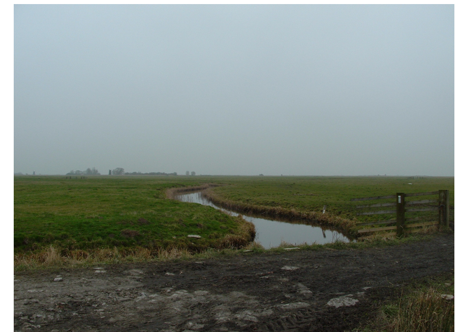
2. A curving boundary dyke near Halvergate Fleet.

The area comprises a vast expanse of marshland developed from an estuary that existed in Roman times but which became cut off from the sea by the formation of the sand bank on which Great Yarmouth has developed. Breydon survives as a relict of the open water, saltmarsh and mudflats of the estuary, as do remains of the two Roman forts that were positioned either side of the seaward entrance. (See C.A.s 20 and 21) The upland edge around the main level estuary area is visibly clear, retaining cliff-like sections in places notably Burgh Castle and West Caister.