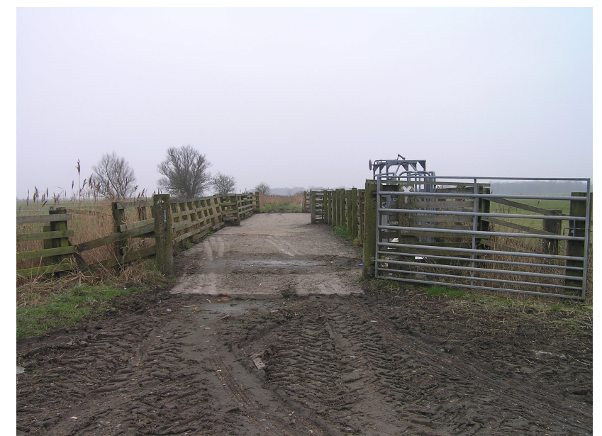
4. Cattle crush for holding and loading/unloading cattle