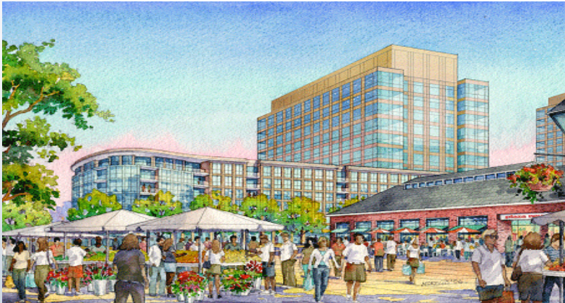
Conceptual Drawing: H-GAC Northside Livable Centers Study