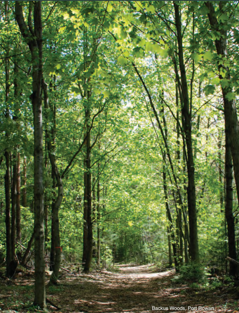
Backus Woods, Port Rowan