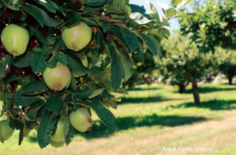
Apple Farm, Vittoria