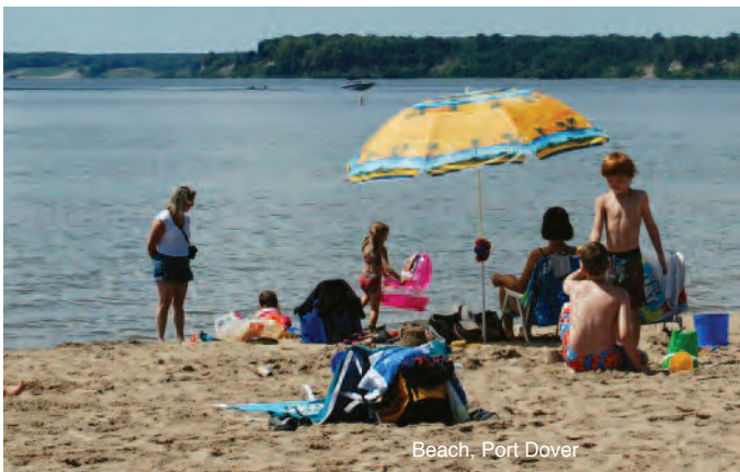
Beach, Port Dover

Working together with our community to provide quality services.