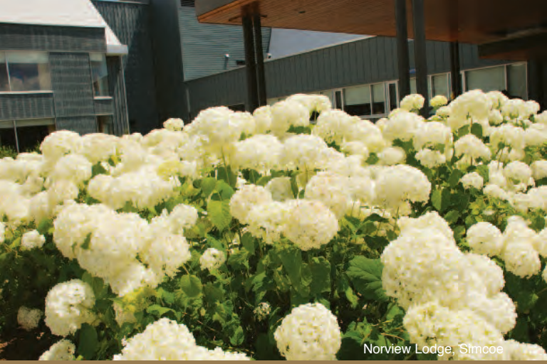
Norview Lodge, Simcoe