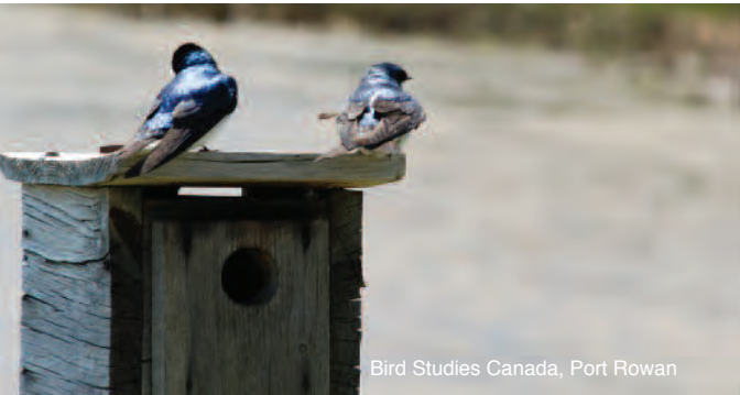
Bird Studies Canada, Port Rowan

In Norfolk County, the strategic planning process aligns Council's Strategic Directions and Goals with the work of staff through the use of Departmental Business Plans. Departmental Business Plans detail the annual activities that will be undertaken to achieve Council's Strategic Plan and these activities will be linked to the annual budget process.