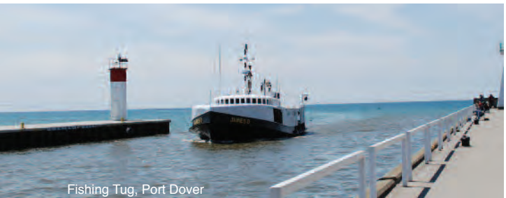
Fishing Tug, Port Dover