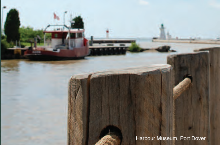
Harbour Museum, Port Dover