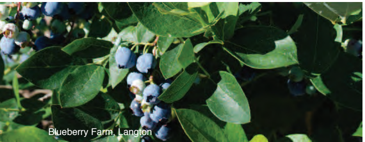
Blueberry Farm, Langton