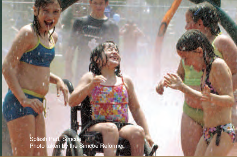
Splash Pad, Simcoe