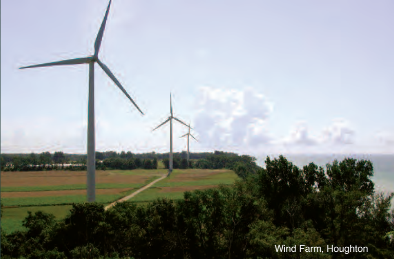
Wind Farm, Houghton