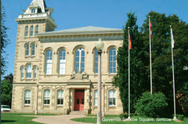
Governor Simcoe Square, Simcoe