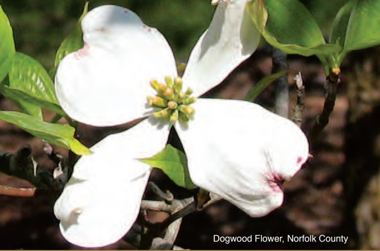
Dogwood Flower, Norfolk County

This is the 2009-2010 edition of Norfolk County's Strategic Plan. Revisions will be made, including the addition of performance measures and targets.