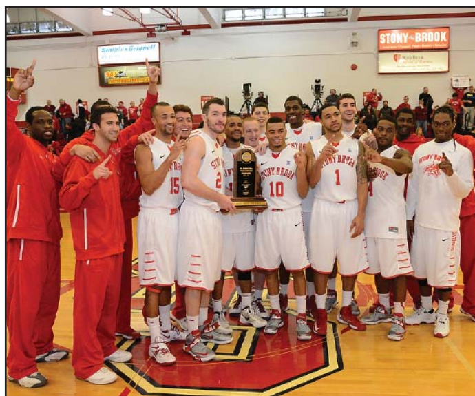
Stony Brook won its third America East regular-season title in four seasons last year.