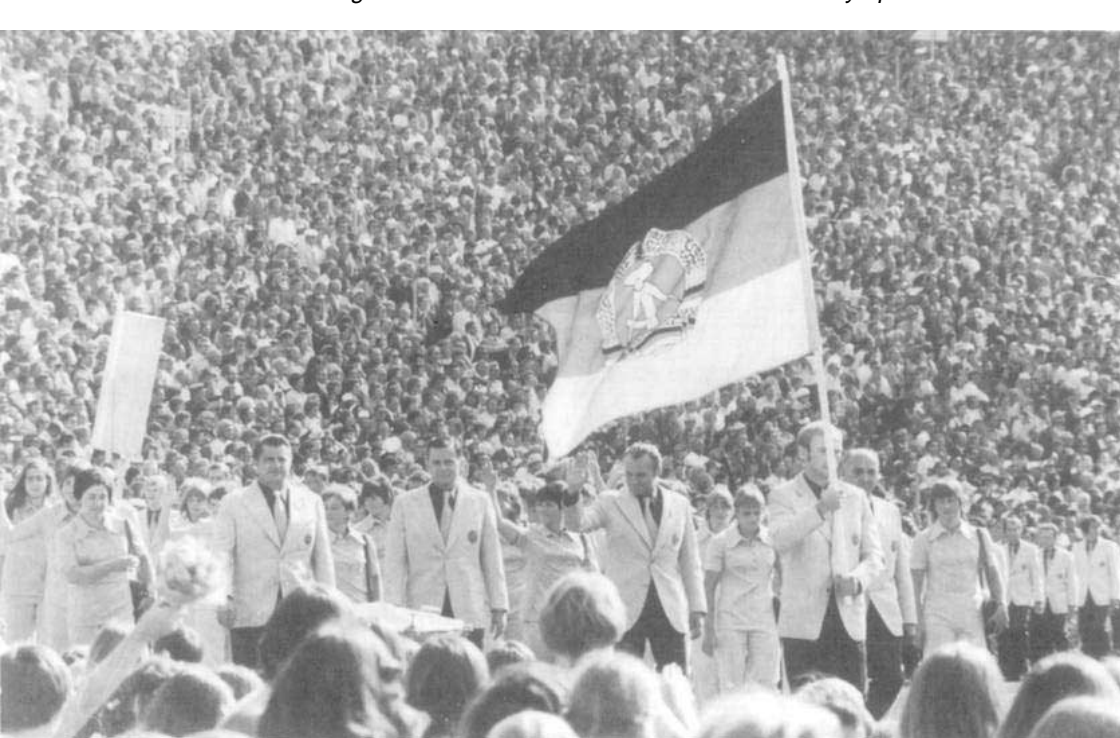
1972 - Munich: The delegation of the NOC of the GDR enters the Olympic stadium.