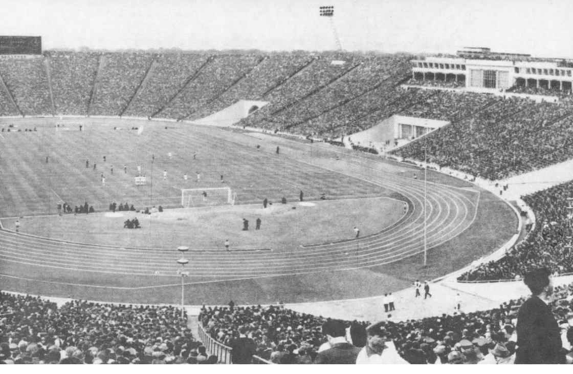
110,000 spectators in the Leipzig central stadium, the biggest in the GDR.