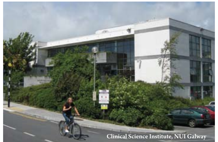
Clinical Science Institute, NUI Galway

Our academics conduct major research programmes in many fields including regenerative medicine (gene and stem cell therapy), health promotion, cancer biology, feto-maternal health, neuroscience, cardiovascular and community health. Many of our researchers are based in the recently established National Centre for Biomedical Engineering Science on the main University campus. A state of the art Clinical and Translational Research centre will be opened on the main hospital campus in 2012.