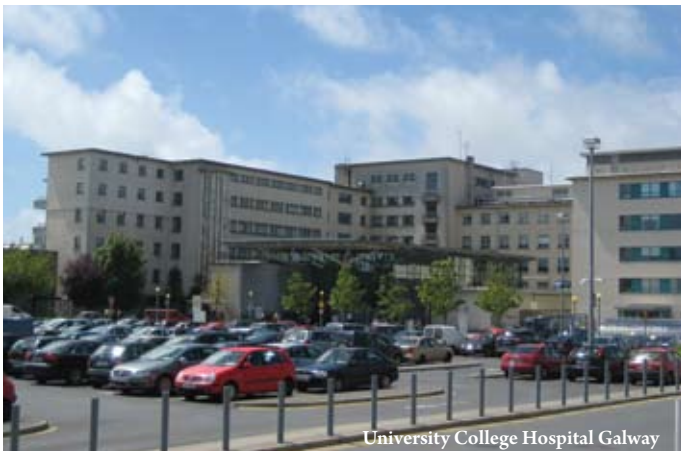
University College Hospital Galway

Galway University Hospitals comprise University College Hospital Galway, (UCHG) and Merlin Park Regional Hospital. UCHG is a 600 bed referral or tertiary level hospital and is located immediately adjacent to the University. Merlin Park Regional Hospital has 200 beds and is 2 Kilometres from the main University campus.