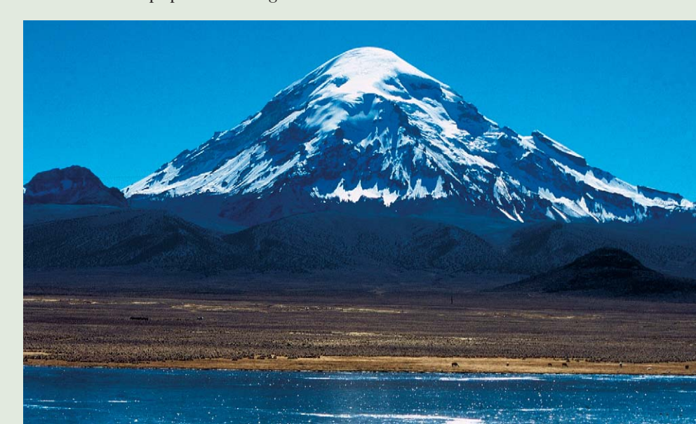
FIGURE 1 Nevado Sajama; in the foreground, a typical wetland.