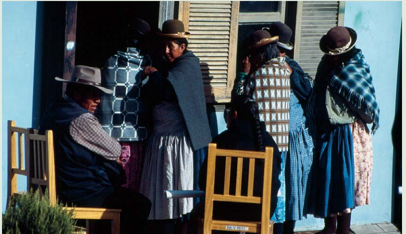
FIGURE 5 Women outside a Management Committee meeting. Unfortunately, only few women have taken active part in such meetings to date, but this is changing little by little; in a year or two, these women observing the meeting from outside might be inside, even speaking up.