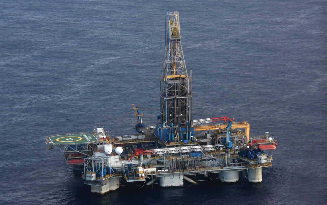
The Homer Ferrington gas drilling rig is seen during President Demetris Christofias' visit in the east Mediterranean, Nicosia.

If 25 per cent of these revenues were transferred to Northern Cyprus, this would be proportionately more significant for its current budget. Turkey has been supporting the Northern Cyprus budget with an annual grant of about $400 million (€325 million), 3 which happens to be in the region of the hypothetical amount of revenues indicated above.