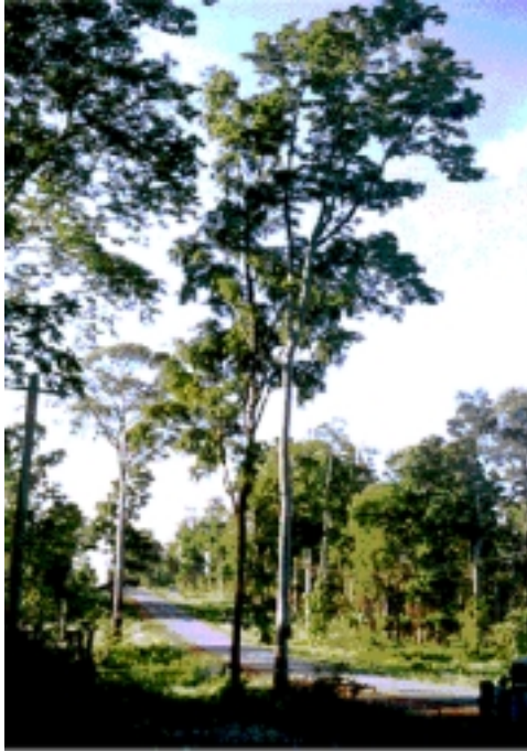
Naturally occurring tree in a national park, north-eastern Thailand.

The seedcoat of this species is so hard that pretreatment with boiling water may not be sufficient to break the dormancy. Furthermore, the large aril delays germination and must be removed. Using a sharp knife, it is possible to cut off the aril together with a small chip of the seedcoat but care must be taken not to damage the radicle. If the seed coat is not scarified while removing the aril, the seed should be nicked at the opposite end. After cutting, the seeds are soaked in water for 12 hours before sowing.