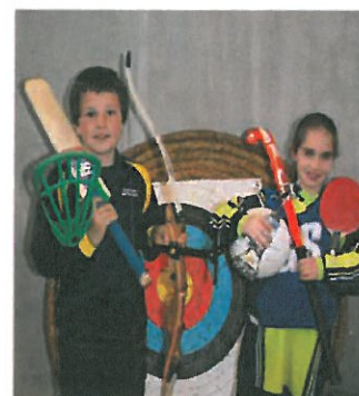
Some of the sports we offer

Sport plays an important role at St. Peter's.