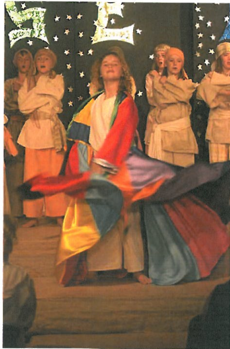
Musical Theatre at St. Peter's. 'Joseph struts his stuff!'