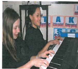
Music at St. Peter's

National Society 200 years celebration service