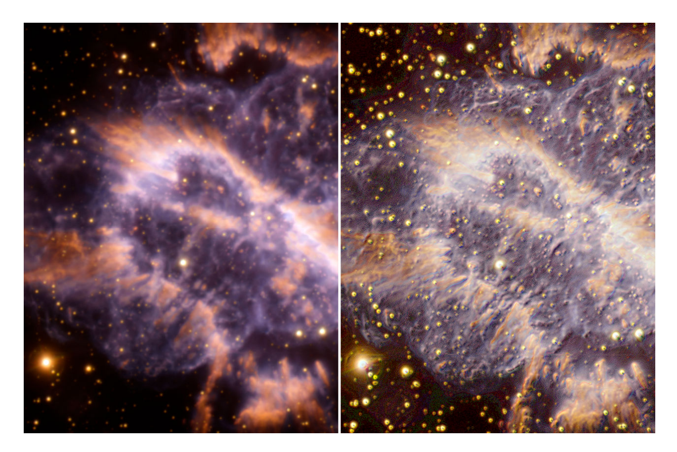
Fig.1 Cometary structures in Ngc5189: on the left the original image from GEMINI web site and on the right the image as obtained after AstroFracTool and GIMP application.