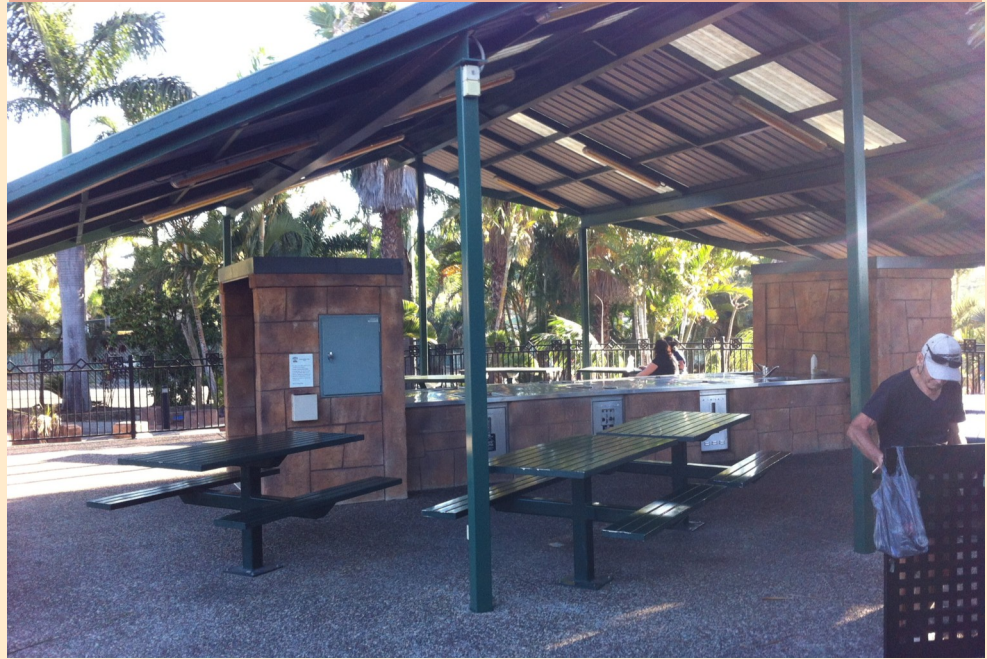
Brisbane Holiday Village Caravan Park